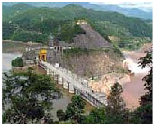
The Manwan Dam

China’s grand Mekong River design will eventually include 15 large dams. The first two, the Manwan and Dachaoshan, were completed in 1993 and 2002, respectively. Together, they generate close to 3,000 megawatts of electricity—equivalent in output to about three large nuclear reactors.