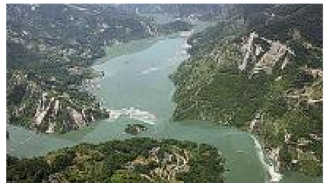
Quake lake bird's eye view