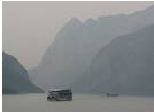
Three Gorges Dam Reservoir

It is not just the waters downstream from the Three Gorges Dam that are suffering. The dam's reservoir itself is slowly, but inexorably, turning into a toxic, turbid stew as it traps more and more pollutants, sewage and garbage behind its "Great Wall" [1].