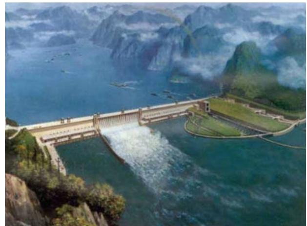
The Three Gorges Dam

China’s “Great Wall on the Yangtze” stands more than 600 feet tall, is almost 400 feet wide at the bottom, and stretches almost a mile and a half across the river. What is most impressive, and potentially most dangerous, about the dam is not its height and width, but rather the mammoth reservoir that the dam has created. This is a reservoir that is 400 miles long and 70 miles wide and holds five trillion gallons of water—equal to one-fifth of all the freshwater consumed in the United States annually.