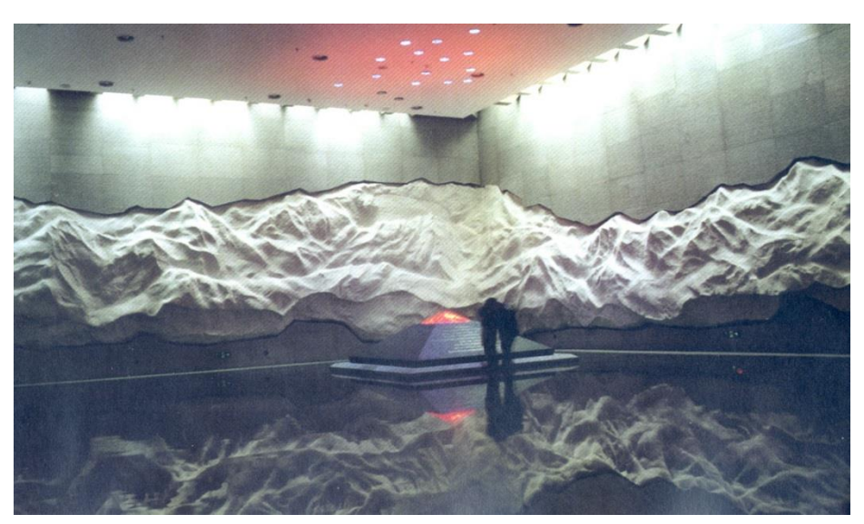
Prefatory Hall of the September 18 History Museum

The major tropes of the external design of the museum and its outdoor memorials and sculptures are presented in more narrative form in the museum exhibitions. First, the Prefatory Hall ( Xu Ting ) echoes the two modes of representing the war and sets the context for appreciating the chronological exhibits that follow.