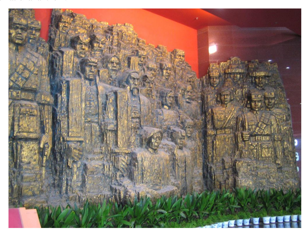
Bas relief in the entrance hall of the War of Resistance Museum

Flesh and Blood ( Ba women de xue rou zhucheng women xinde changcheng ), a line from the Chinese national anthem.