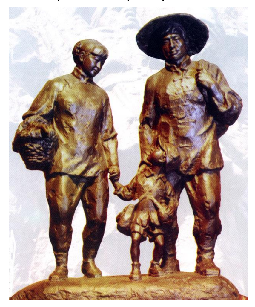
"The Monument to the Chinese Foster Parents," a sculpture near the end of the basic exhibition in the September 18 History Museum

sculpture "The Monument to the Chinese Foster Parents," a memorial donated by Japanese to the Chinese parents who raised Japanese children orphaned by the war.