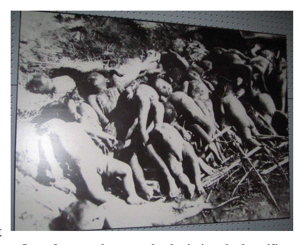
One of many photographs depicting the horrific consequences of Japanese chemical weapons in a special exhibit in the Northeast Martyrs Memorial Hall, Harbin

The language of the placards is emotional. For example, the title of the second part of the exhibit is Diabolical Evil, Madness Enacted (qiongxiong ji'e, fengkuang shishi). The exhibit ends with the exhortation: "Don't forget national humiliation, revitalize China" (wuwang guochi, zhenxing Zhonghua), set on a collage of images of a strong industrial and military China.[36] The example of the Northeast Martyrs Memorial Hall shows us two modes of narrating Japanese imperialism: an older narrative that stresses the glorious memory of resistance and heroic sacrifice; and a new narrative of horror, atrocity, and victimization that is explicitly connected to China's future as a strong nation.