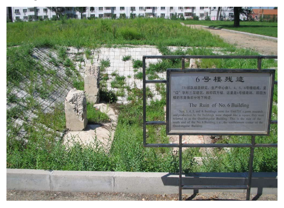
Ruins of one of the structures on the Unit 731 complex

Behind the exhibition building are "ruins"—the foundations of buildings that were part of the larger Unit 731 complex.