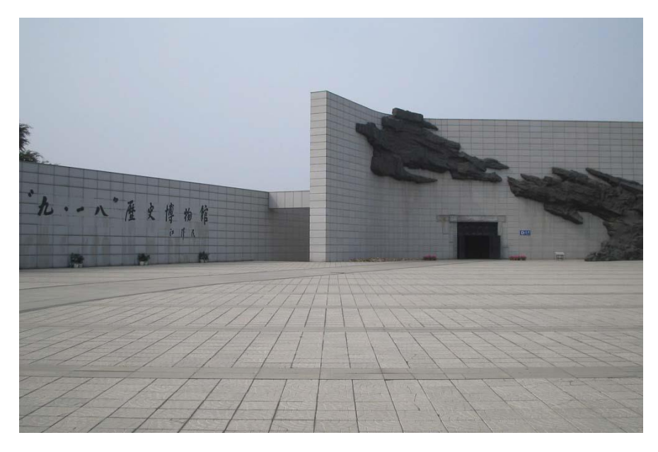
Main exhibition hall of the September 18 History Museum

The museum building is among the more interesting architectural designs of new museums in the PRC.