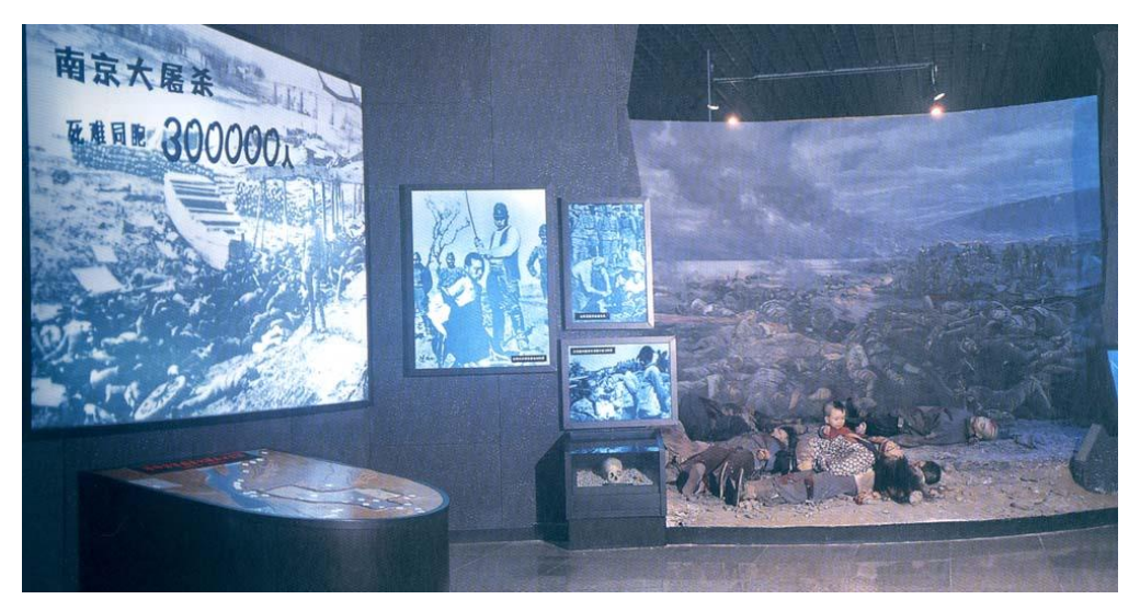
Exhibition space in the Japanese Army Atrocities Hall

By contrast, the Japanese Army Atrocities Exhibit is dominated by several life-size dioramas of atrocities. One presents a three-dimensional scene of the bloodied bodies of women and children set before a large mural depicting a battlefield strewn with bodies extending far into the distance.