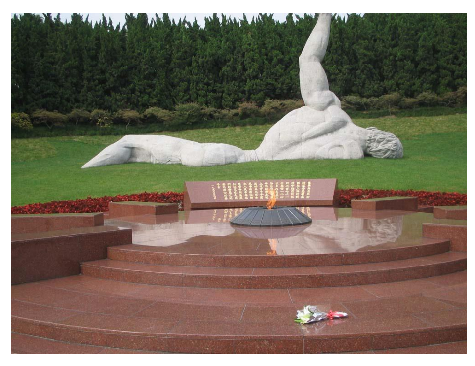
Unknown soldier statue, Longhua Martyrs Park, Shanghai