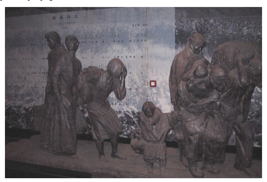
"Sorrow of Exile" sculpture depicting refugees

Music often combines with three-dimensional visuality to give many displays a highly theatrical quality. For instance, in the second exhibit hall there is a display of bronze statues of refugees titled "Sorrow of Exile" ( Liuwang hen ), which shows an array of citizens fleeing the Japanese occupation of the Northeast. The "citizens" include peasants, but also students, who appear to be doing anti-Japanese propaganda work.