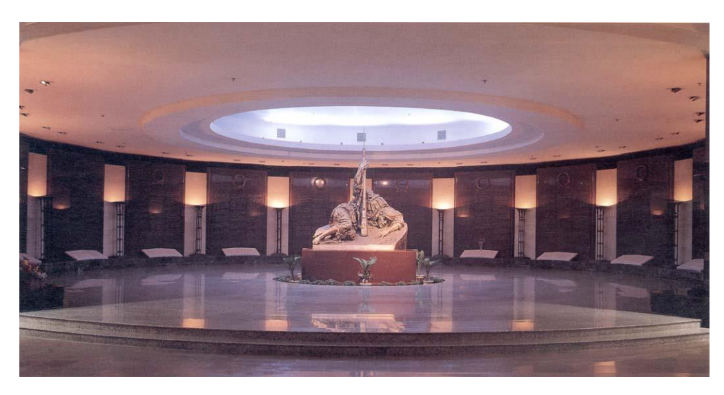
Unknown soldier in the center of the Martyrs Memorial Hall in the War of Resistance Museum outside Beijing

This centerpiece coveys something of the ambiguity of the martyr image in Chinese revolutionary iconography: at once a victim of oppression and a heroic resister who struggles against that oppression, drawn toward death, the past, and the earth, but lifting himself toward life, the sublime, and the future. Martyrs are tied to the past, a memory of that past, but they are also guiding spirits for the future. The statue of the unknown soldier thus embodies the larger tension in the museum's exhibitions between the victory and victim narratives.