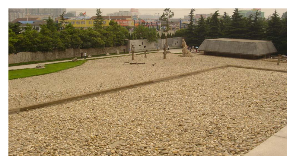
Graveyard grounds at the Nanjing Massacre memorial

The third and final section of the memorial site is the historical exhibition, which is housed in a half-underground building and gives an overview of Japanese imperialism in China and of the massacre itself. The exhibit opens with a statue titled "Mother and Child" ( Mu yu zi ), which shows a mother holding the limp body of her dead child, a sacrificial victim of the slaughter, and harkens back to the Mother figure in the graveyard grounds. The mother-child union is a powerful one, commonly used in socialist iconography. Behind the figure is a large photographic mural of dead bodies, above which looms the number "300,000." Clearly, the use of mother and child as the opening image of the exhibits is meant to suggest the innocence of the victims as a whole and to reinforce the barbarity of the Japanese for severing the most fundamental of all human relations.