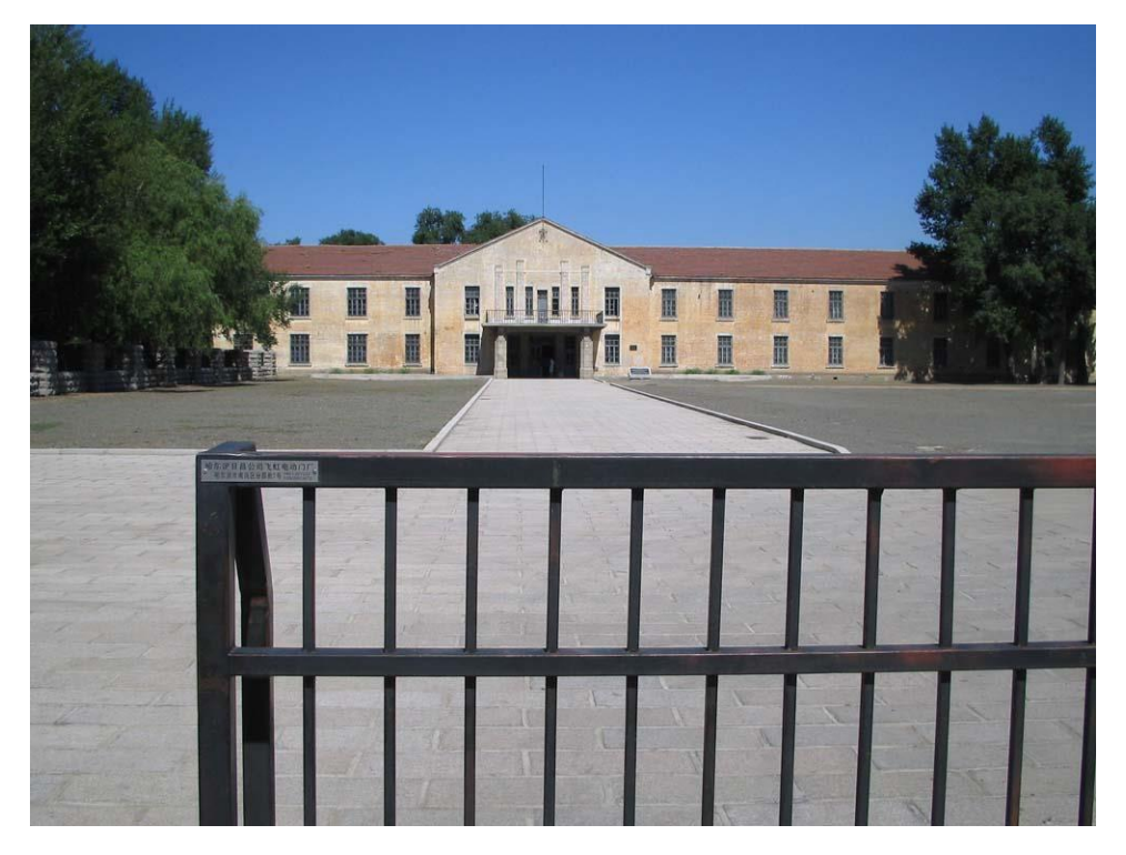
Entranceway, courtyard, and exhibition hall of the Unit 731 Museum

The Crime Evidence Exhibition Hall of the Japanese Imperial Army Unit 731 in Pingfang, Heilongjiang, was established in the early 1980s in a building that is part of a much larger site used by the infamous Japanese Army Unit 731 to commit medical experiments on thousands of Chinese (as well as some Russians, Koreans, and others) from 1939 to the end of the War of Resistance Against Japan.[50] In 1995, a new building to house the exhibits was constructed down the road from this site. In 2001, however, the exhibit was brought back to the original site, now renovated.