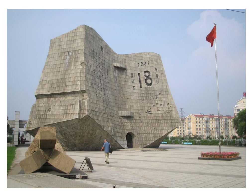
Stone calendar statue in the courtyard of the September 18 History Museum

The text on the calendar reads: "Around ten o'clock at night, the Japanese army blew up the Liutiao Lake section of the Southern Manchurian Railway. Under the pretext of blaming the Chinese army for committing this act, they attacked and occupied the army's north headquarters. Under orders not to resist, our northeast army retreated in pain, disaster befell the nation, and the people rose up angrily in resistance." Although it is intended to stress the historical importance of this date in Chinese history, the calendar also suggests that time has stopped and that China is somehow stuck in the memory of this national insult. However, by commemorating this tragic event, the museum will help China to flip the pages of history forward and leave the humiliation of that event behind.