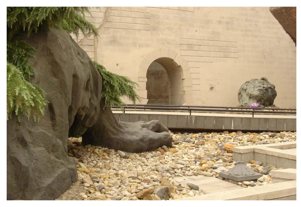
"Disaster in the Ancient City," a sculpture at the end of the entrance courtyard in the Nanjing Massacre memorial