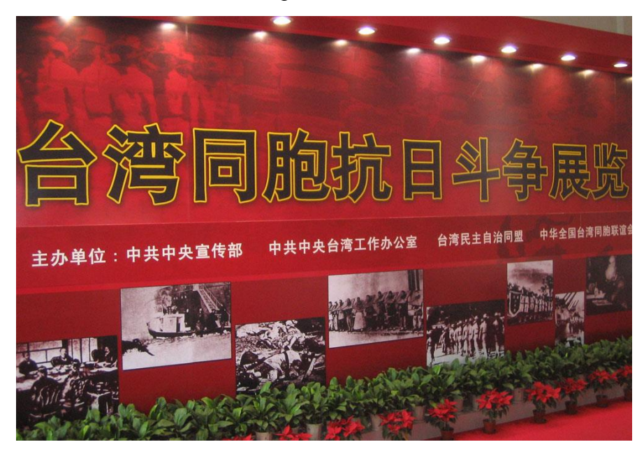
Sign at the entranceway of the Anti-Japanese Resistance Struggle of Our Taiwan Compatriots exhibit, held at the National Museum of China in 2005

affective response. These museums fuel nationalist sentiment, and the trauma of the past gets channeled toward an enemy and expressed in patriotic rage. The museums link together lost territory and the physical suffering of the Chinese body politic. This specular attention to the suffering of one's fellow Chinese is a hook the state can use to "create a common memory, as a foundation for a unified polis." As such, these museums are part of a larger move in museums of modern history in the PRC away from messages of class struggle (or the unity of class struggle and national resistance), which can potentially be turned against the state in the context of market reforms and the reemergence of class divisions, toward more nationalistic themes.[21] In recent years, the idea of a common memory of resistance to Japan has been used to forge historical links between Taiwan, Hong Kong, and the mainland and thereby draw attention to their shared identity and political destiny. In the fall of 2005, the National Museum of China put on the much-publicized Exhibition on the Anti-Japanese Resistance Struggle of Our Taiwan Compatriots ( Taiwan tongbao kangri douzheng zhanlan ) (fig. 1), and the place of Taiwan resistance is much more prominent in the 2005 renovated exhibit at the War of Resistance Memorial Hall than it was in the museum's previous exhibit.