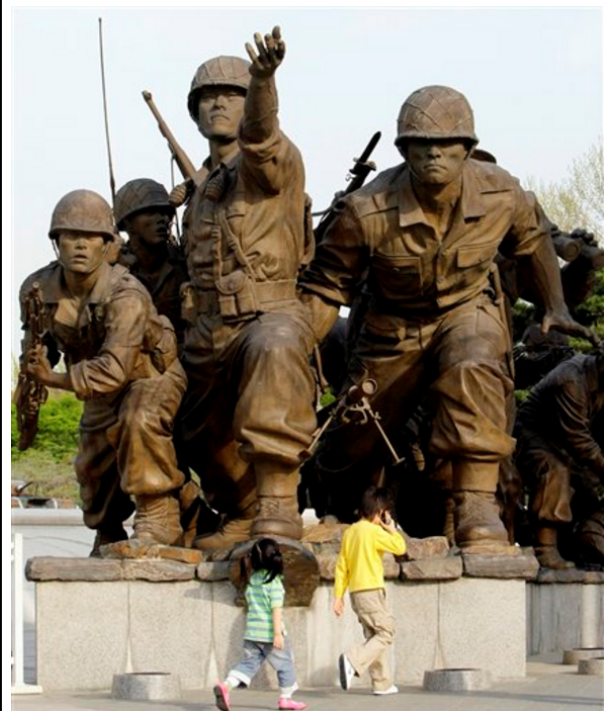
Korean War Monument in Seoul

The Korean War, which began with North Korea's surprise invasion of South Korea on Sunday, June 25, 1950, lasted for three years. The hostilities ended with the signing of an armistice agreement in July 1953. This war broke out only five years after the Korean Peninsula had been liberated from Japanese colonial rule, and only three years after the establishment of separate North and South governments, in a nation divided by foreign powers. The war's devastation left much of South Korea in ruins, along with its people in social turmoil. Sixty years hence, South Korea now strives to play a central role in resolving the common problems of the global community, as evidenced by its hosting of the G-20 Summit in Seoul, in November 2010.