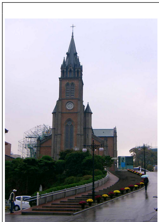
Myongdong Catholic Cathedral in Seoul

the military personnel and POW detainees as well. It has been noted that the Christian leaning administration of President Syngman Rhee's also served to promote its acceptance among the general populace. Christianity was seen as a means to obtain relief supplies, as well as a pathway to the United States and a way to taste a piece of the American lifestyle in Korea. With so many Koreans relying on the church for food aid, the United States came to be stamped indelibly into the minds of Koreans as a "land of grace." There are scholars who trace a tendency among Christian circles, to believe that material blessings will naturally follow from a belief in Christ to people's experiences of the war and its aftermath.