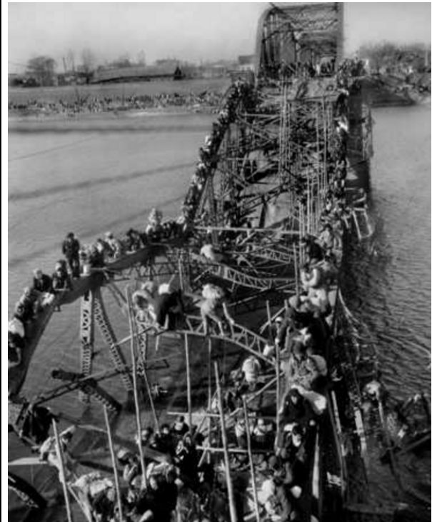
Refugees Fleeing across the Han River, 1950

In the early stages of the Korean War, the South’s porous defensive efforts and misguided measures of an inexperienced government resulted in North Korea’s occupation of numerous South Koreans, who were forced to comply with orders of the Northern troops. The chaotic situation was worsened by the South Korean government’s bold pronouncements early on, only to find itself hastily abandoning Seoul shortly thereafter. Many of the people who did not escape the sudden onslaught suffered from such atrocities as massacre, torture, imprisonment, and abduction, while those who survived were often branded “collaborators,” leaving them with a permanent black mark. The so-called background checks, which were rigorously enforced through the 1980s, served as a de facto guilt-by-association system that did not allow suspected individuals to assume public office.