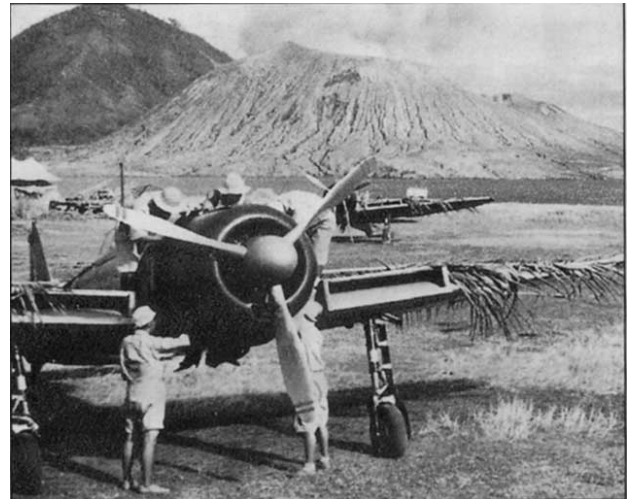
Japanese Zero Airfighter in New Guinea

While there has been considerable understatement of the sexual exploitation of Asian and mixed race women by the Japanese, it is probably still fair to say that while particular New Guinean women were raped, the rate of violation was less than the Allies expected, and less than could have been expected from most occupying armies. But there is no obvious relationship between the sexual safety of Asian, mixed race and New Guinean women and the presence of comfort women.