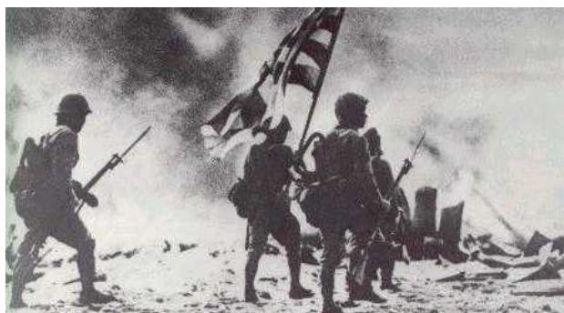
Japanese marine attack Rabaul in 1942.