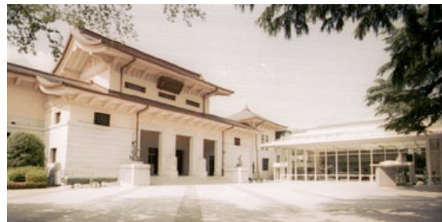
The Yushukan Museum

However, Roh countered the Japanese delegation by throwing a close breaking pitch, saying, "If possible, I wish to visit Yushukan," referring to the museum that stands on the grounds of Yasukuni Shrine. Both visiting and receiving Japanese and South Korean officials are engaged in a psychological war in which foreign and domestic situations are intricately entangled.