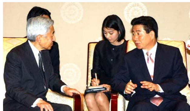
Emperor Akihito meeting with South Korean President Roh Moo-hyun

The same pattern applies to the administration of Fukuda's father, former Prime Minister Fukuda Takeo, under whom Fukuda served as an aide. In 1978, the senior Fukuda significantly advanced "Japan-China reconciliation" by signing the Japan-China Peace and Friendship Treaty by placating rightist opponents. It was also around the same time that the Fukuda administration paved the way for the enactment of the Gengo (the name of a Japanese era) Law in 1979. This law, too, was established in response to fervent requests from rightists.