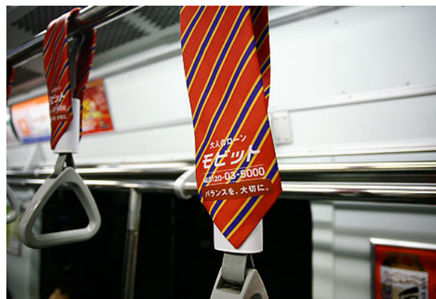
Subway ad for a loan company