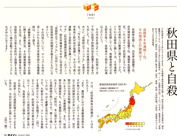
Suicide rates in Tohoku shown in red