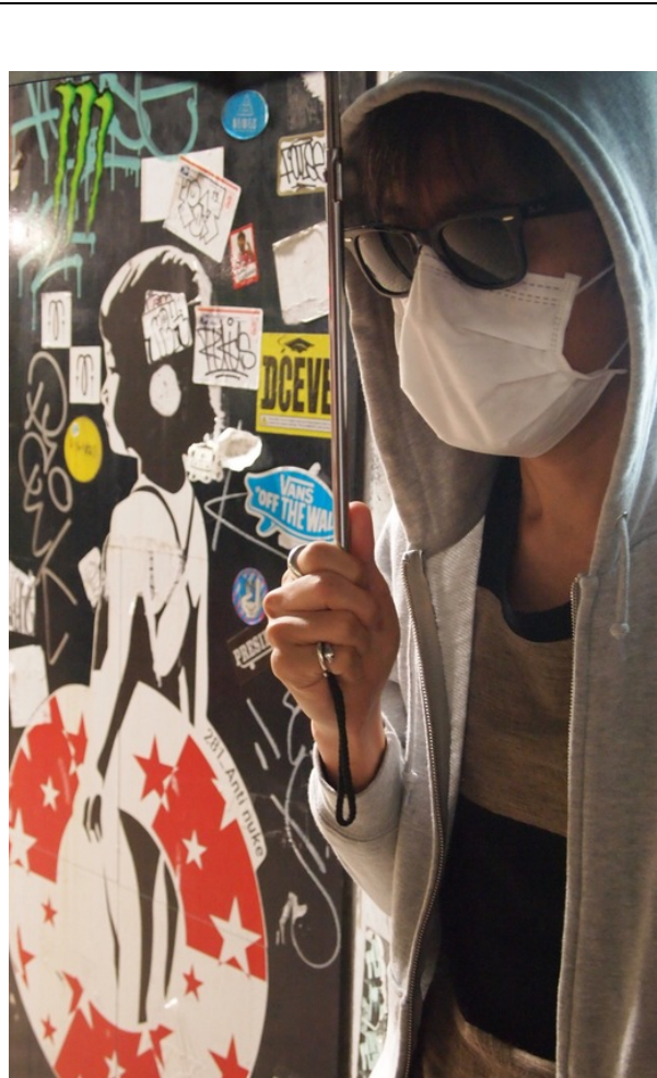
Up close and personal with 281

"Japan is at a changing point in its history. I want this country to find a better path. If we don't give up, then I'm confident we'll succeed in changing it."