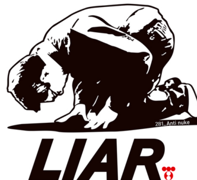
... and 281's interpretation of the event.

The same child in the "I hate rain" sticker features in other 281 designs. In one, she plays on a swing as radiation signs fall like snowflakes around her; in another, dressed in a swimsuit, she hugs an irradiated life-ring. Like all of 281's work, the power of these designs lies in their simplicity. The radiation expelled by the twin meltdowns has tainted all aspects of children's lives and cast doubts on the safety of everyday activities that used to be taken for granted.