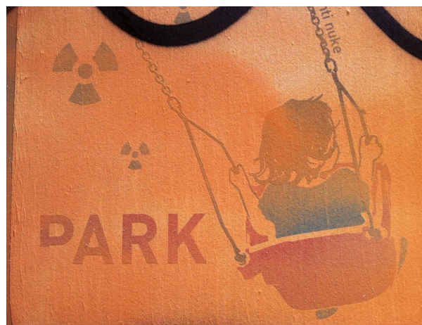
The omnipresent fear of radiation

281 had meant the comment as a joke but there was more truth to the superhero comparison than this modest man would ever admit. Science fiction is full of stories where radiation transforms the destinies of normal men. Following the apocalyptic disaster at Fukushima, this mild-mannered father was forced to take the law into his own hands to protect the life of his child - and the lives of children all over the nation.