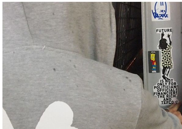
281 at work in Shibuya

has been quick to create scapegoats of resident Koreans - including the massacre of thousands of resident Koreans following the 1923 Tokyo earthquake. Recently such antagonisms have resurfaced due to maritime disputes between Seoul and Tokyo over control of Dokdo-Takeshima Islands. Right-wing protesters have taken to picketing Tokyo's Korea Town in Shinjuku and there was a large contingent of rightists present at January's Okinawan rally in Hibiya to accuse island leaders of being stooges for both Korea and China. 6