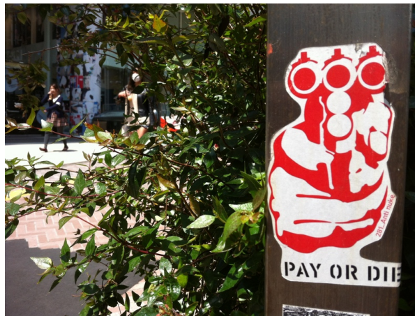
TEPCO - holding the country at ransom to nuclear power

First there were the revelations that the government had concealed the meltdowns, followed by news that they had hidden information regarding the dispersal of radiation - data that could have protected fleeing residents from exposure - and the fact that they'd allowed large volumes of tainted water to flow into the sea. 281 came to the conclusion that there was very little natural about this disaster - it had occurred as a result of ties between the Japanese government and the nuclear power station's operators, TEPCO - both of which were determined to keep the truth hidden from the public.