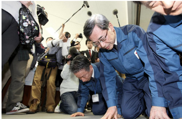
Shimizu Masataka and TEPCO top officials kneel in apology to evacuees in Fukushima in May 2011.

Over the following months, 281 put up hundreds more posters and stickers to remind the public what the Japanese government and TEPCO were conspiring to make people forget. One of them showed silhouettes of the Hiroshima and Nagasaki bombs alongside the TEPCO logo. Another portrayed former TEPCO president Shimizu Masataka kneeling on the floor in his famous apology to evacuees in Fukushima in May 2011. 281's message beneath the picture? Liar.