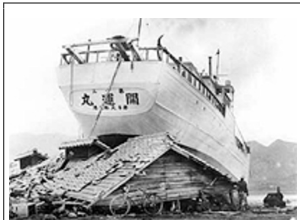
It took nearly 24 hours for tsunami waves created by the Chilean earthquake of 1960 to reach the Japanese coast.

e360: It originated in roughly the same area as the recent tsunami?