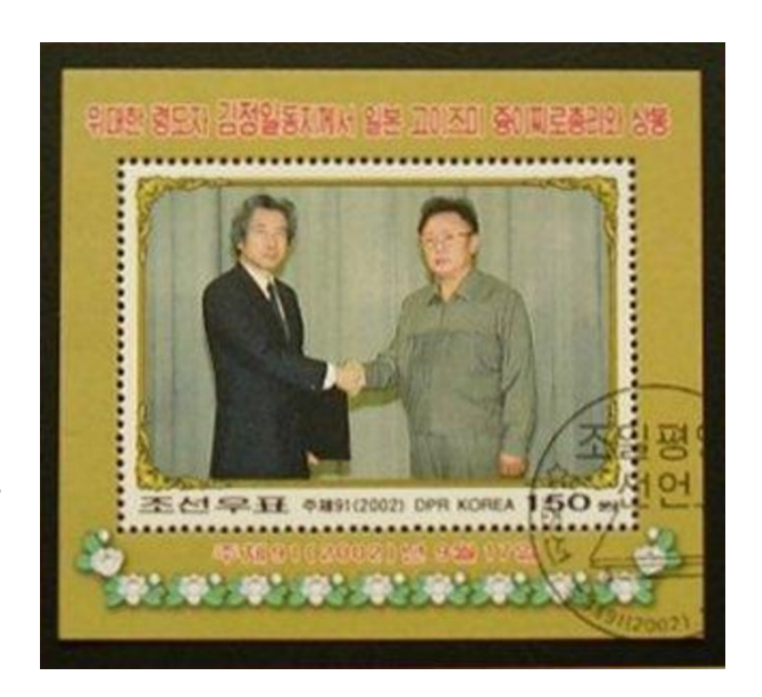
North Korean Stamp to Commemorate the Koizumi Visit

At Pyongyang, the two leaders agreed to "make every possible effort for an early normalization of relations." Koizumi expressed "deep remorse and heartfelt apology" for "the tremendous damage and suffering" inflicted on the people of Korea during the colonial era, while Kim Jong II apologized for the abductions of 13 Japanese and for the dispatch of spy ships in Japanese waters. North Koreans informed Japan that 8 of 13 were dead and 5 survived.