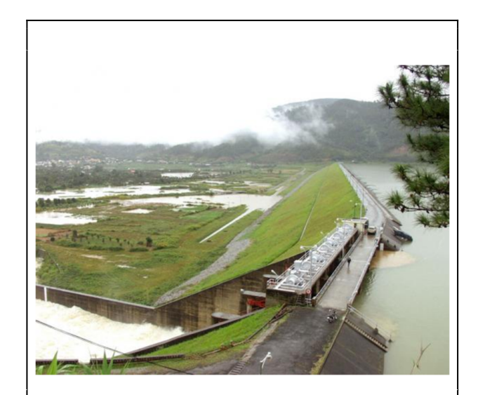
Da Nhim flood control gate

it was also specified that all services supplied would be by Japanese nationals or groups (See this link). This was a propitious start to what would emerge as a prestigious project, one that still plays a part in hydraulic control of the Da Nhim Valley.<sup>3</sup>