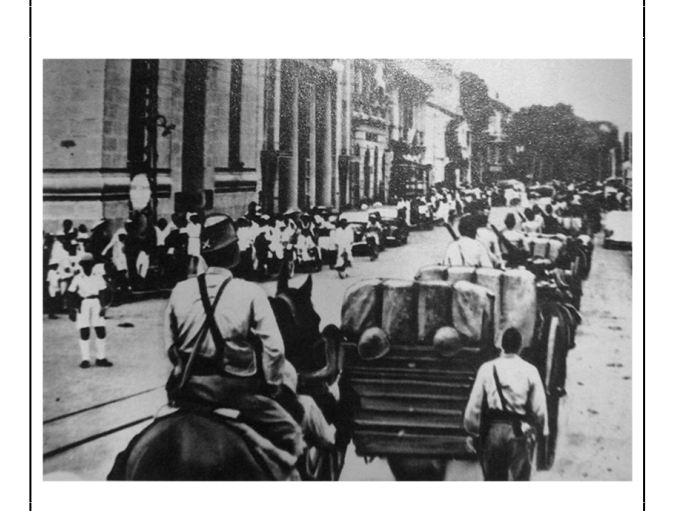
Japanese Troops enter Saigon September 1940

This article seeks to disentangle the complex claims and counterclaims to Japanese war reparations deriving from the period of Japanese rule in Vietnam in the years 1940-45.