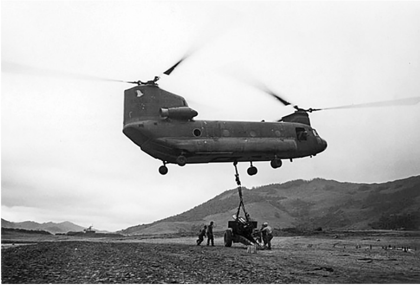
Figure 9 CH-47 airlift of a 155 mm howitzer, 1969

Offensive, General Uprising (GOGU) to correspond with the Tet holiday in 1968. Though the event was a military disaster for the North, the volume of opposition to the South's government convinced Americans that the war could not be won at an acceptable cost. Similar dynamics reinforced this logic during the April 1972 Easter Offensive. In both cases, observers interpreted the high casualties incurred by the North Vietnamese as signs of strong political commitment. 156