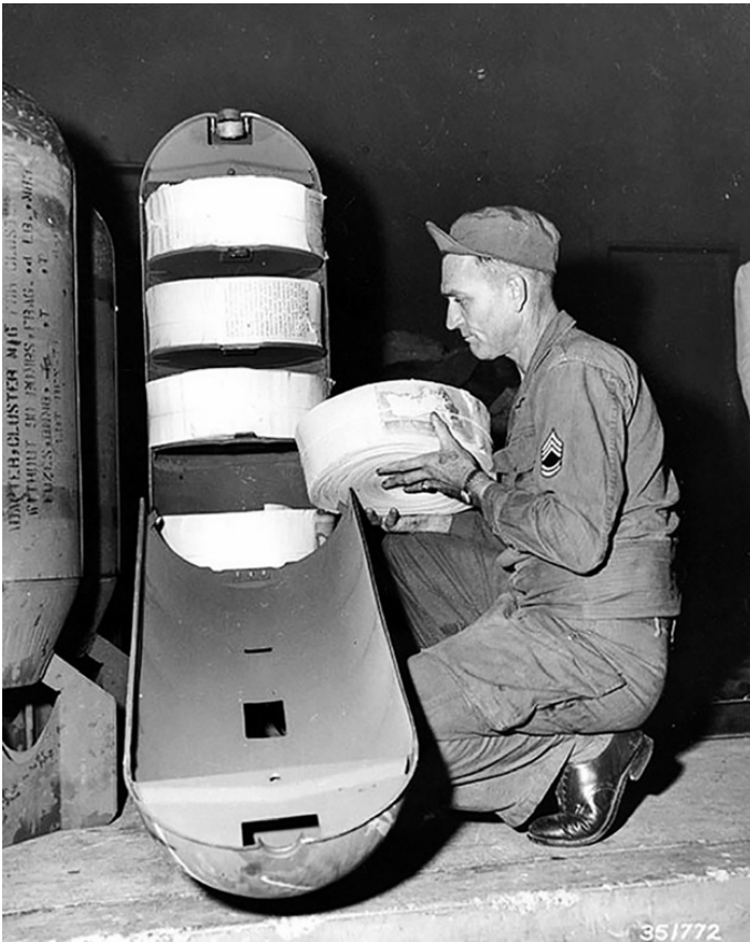
Figure 8 Korean War leaflet bomb, 1950

Wehrmacht counterinsurgency campaigns resonated with more general efforts to learn lessons about fighting communist forces in Eastern Europe. U.S. officials proved ambivalent about the Nazi performance in occupied territories, as they noted that brutal treatment of civilians often bred insurgency while at the same time commending the operational skill of the Wehrmacht . German-inspired theory remained consistent with what the United States had practiced throughout its own history: (1) to isolate fighters from the population, by forced migration if necessary, (2) to deny guerrillas foreign aid, and (3) to destroy the enemy through aggressive, offensive-minded patrols. These goals called for large numbers of infantry, supported by elite small units (in Germany, the Jagdkommando ), as well as by local civilians to be recruited as guides, spies, and auxiliaries. Volckmann's FM 31-20, Special Operations Techniques , was