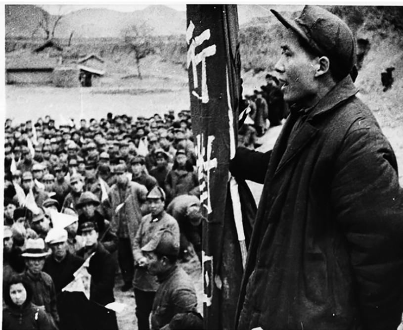
Figure 7 Mao Tse Tung addresses followers, December 6, 1944, Franklin D. Roosevelt Library, Public Domain Photographs, NARA, Wikimedia Commons

popular sentiment developed over the course of decades, swept their rivals off the mainland by 1949. 132