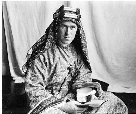
Figure 5 T.E. Lawrence, photograph by Lowell Thomas, 1919, Wikimedia Commons

Above all, Lawrence noted the shift in temporal mindset necessary for colonial operations. Whereas conventional military commanders strove for