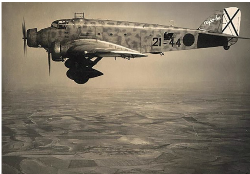
Figure 6 S.81 airplane, c. 1940

mustard gas to deny mountain passes and immobilize retreating Ethiopian units was an “exceedingly cunning use of this chemical,” whereas Emperor Selassie complained that the gas attacks were imprecise, harmful to soldiers and civilians alike. Foreign observers estimated that the outlawed chemical agents caused about one third of the Ethiopians’ 50,000 casualties throughout the war. 122