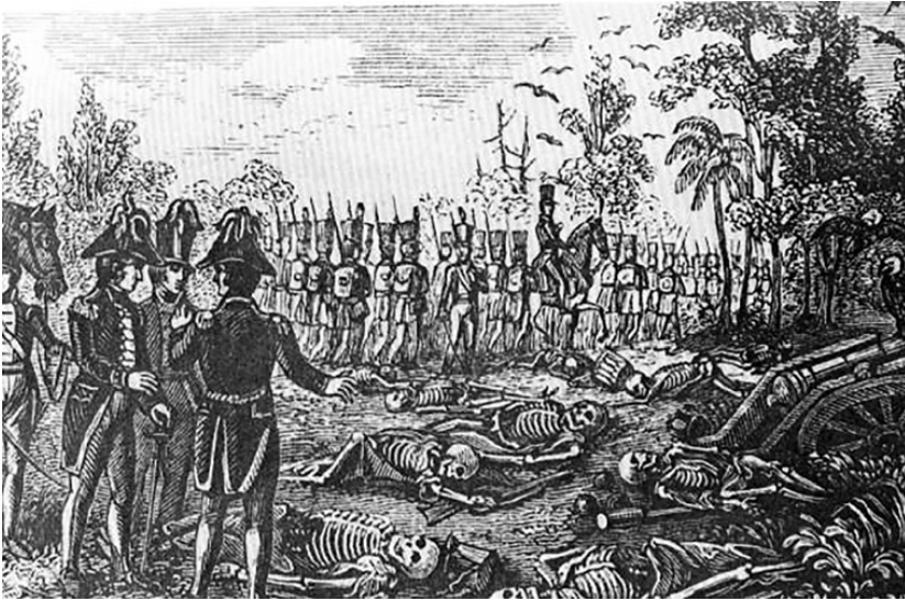
Figure 1 Engraving, “Viewing the Demise of Major Dade and his Command in Florida,” c. 1870

of the weaker side: guerrillas (“small” warriors unable to field heavy weapons), insurgents (rebels from within a recognized polity), irregulars (whose practices fall outside normative military practices), or terrorists (defined by inhumane tactics).