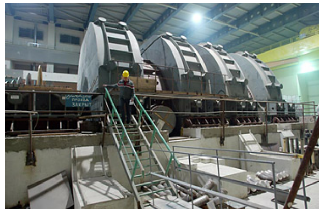
The Bushehr nuclear power plant