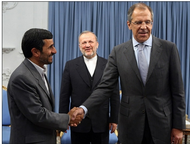
Iranian Prime Minister Mahmoud Ahmadinejad (left) shakes hands with Sergei Lavrov as Manouchehr Mottaki looks on

Foreign ministers are busy people - especially energetic, creative diplomats like Russia's Sergei Lavrov and Iran's Manouchehr Mottaki, representing capitals that by tradition place great store on international diplomacy.