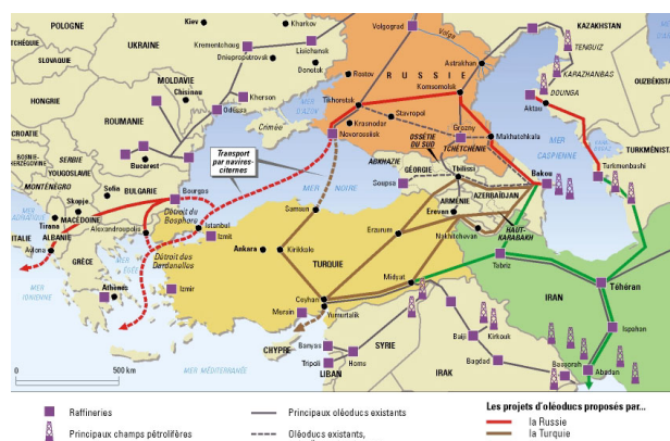
Caspian oil and gas pipelines and projected lines

agreement relating to the Caspian littoral pipeline on December 12 with his Kazakh and Turkmen counterparts, the curtain came down on one of the grimmest struggles of the great game in the post-Soviet era. Moscow came out the winner by far, reasserting its pre-eminent position in the Caspian.