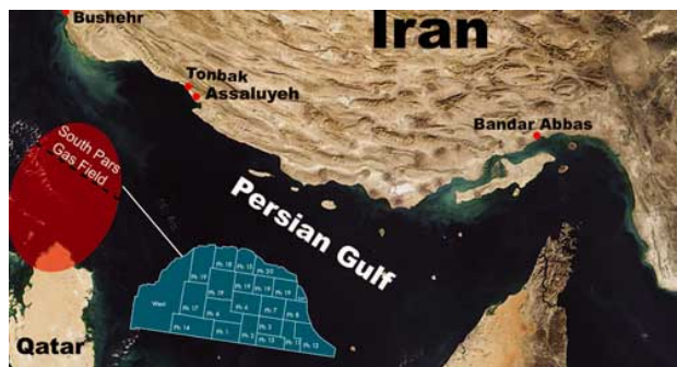
The South Pars Field

Russia's number one priority in energy cooperation with Iran will be for upstream participation by Russian companies. Gazprom has had some limited participation so far in the early phases of Iran's massive South Pars gas fields with an estimated aggregate cumulative production range of a stunning 13 trillion cubic meters. Moscow will be keen to promote greater involvement. Gazprom has shown interest in the Iran-Pakistan-India pipeline project not only as a contractor but also as an investor.