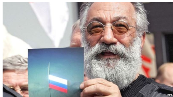
Artur Chilingarov , head of Russian expedition to the Arctic-2007, shows picture of Russian flag in the seabed below the North Pole in August 2007.

controlling the Northeast Passage to prevent foreign intervention, and defending the sea lane to East Asia (OPRF 2012). A statement of principles, approved by then Russian President Dmitry Medvedev in 2008, regards the Arctic as a strategic resource base of primary importance to Russia. Foreseeing the possible rise of tensions developing into military conflict, the document prescribes “building groupings of conventional forces in the Arctic zone capable of providing military security in different militarypolitical conditions” ( Rossiyskaya Gazeta 2009).