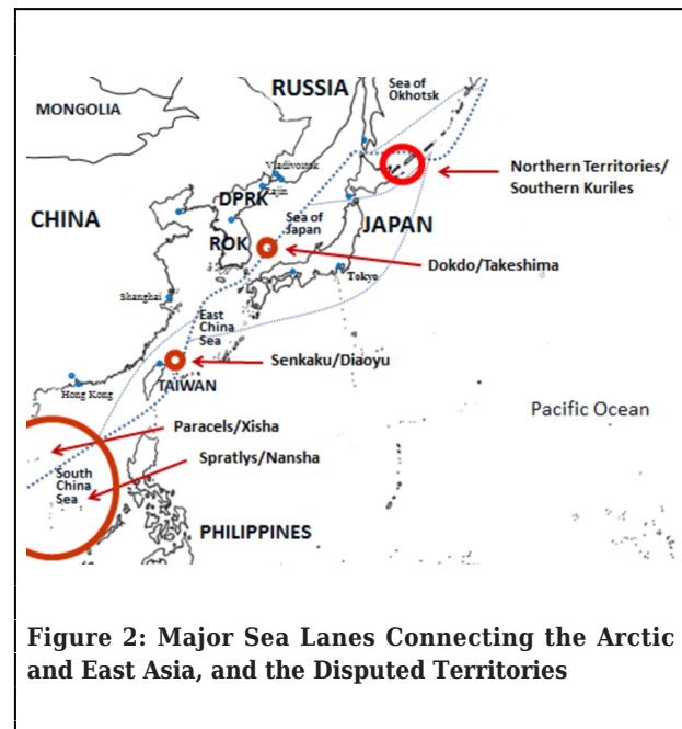
Figure 2: Major Sea Lanes Connecting the Arctic and East Asia, and the Disputed Territories

Spratlys and Paracels) located in the sea lanes connecting the Pacific Ocean, the Sea of Okhotsk, the Sea of Japan (East Sea), the East China Sea, and the South China Sea. This might motivate the concerned states to effectively manage and even to reach some settlement in their territorial and maritime border disputes.