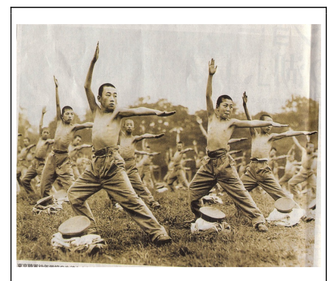
Morning calisthenics at the Tokyo Infantry Middle School, 1943.

one objective." The three-year course did not differ significantly from the standard jun ior high school education with a special emphasis on "cultivating a warrior spirit." All students slept in barracks and woke at 6 a.m. to reveille. Then they dressed in uniform, stood in formation, bowed in the direction of the Imperial Palace in Tokyo, recited from a military primer, and had their rifles inspected. Students were taught how to handle the katana sword, imperial history, army regulations, military music, and kendo and weapons training.