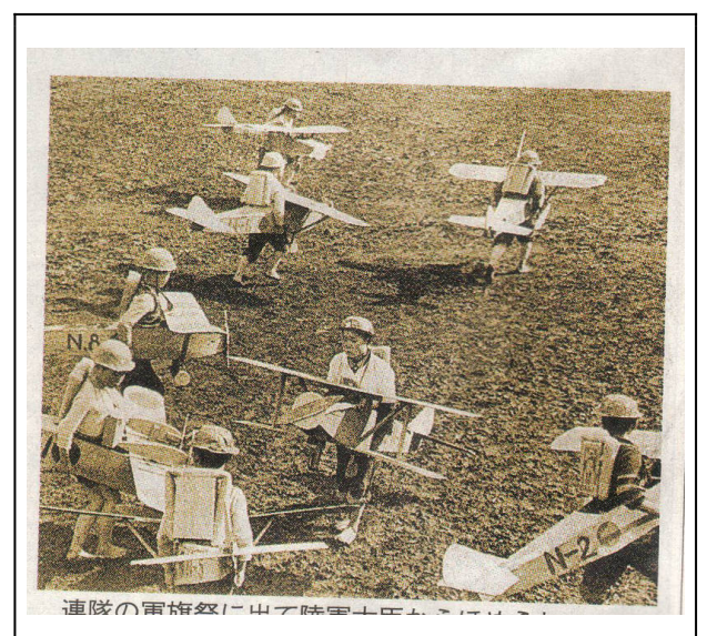
Children from a village primary school perform a "dogfight" which was watched and praised by Army Minister Tochigi in February 1940. The airplanes were built by students from the local girls' high school for the Military Banner Festival.

In the 1930's as the military strengthened its position in the highest echelon of government, children's lives became more colored by wartime ideology. In 1934 the first directive ordering schools to train students "psychologically and physically" was iss ued. This was followed by the Education Edict of March 1941 that renamed primary schools ko kumin gakko (schools for national citizenry). The goal was to provide primary-level education in the imperial way and to polish and perfect (rensei) the individual's sense of national duty. Martial arts, formation drills, model recitations, and ritualized displays of respect for the Emperor became part of the regular curriculum. Pre- and primary-school age children were called sho-kokumin (literally "little citizens").