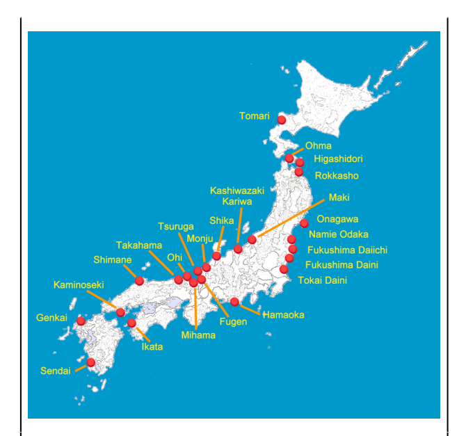
Japan's major nuclear power plants and the centers for nuclear waste disposal

Third, there seems to be some confusion between opulence and societal well-being in Japan. Amartya Sen writes as follows: "Human beings are the agents, beneficiaries and adjudicators of progress, but they also happen to be - directly or indirectly - the primary means of all production. This dual role of human beings provides a rich ground for confusion of ends and means in planning and policy-making" (Sen, 2005, p. 3). Sen clearly distinguishes between economic prosperity and human well-being. "First, economic prosperity is no more than one of the means to enriching the lives of people. It is a foundational confusion to give it the status of an end. Secondly, even as a means, merely enhancing average economic opulence can be quite inefficient in the pursuit of the really valuable ends." (ibid., p. 4).