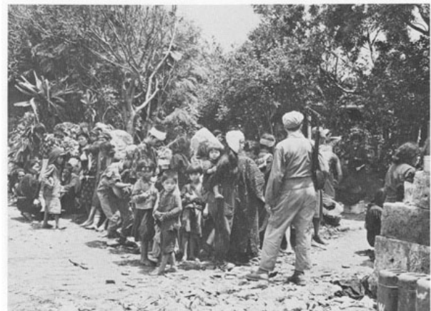
FIGURE 81.—Civilians of Okinawa, casualties from the battle areas, await their turns at the military government medical aid station, Gushikhan, Okinawa, June 1945.

The enormous sacrifices on both sides in this battle, including an approximate total of 200,000 dead[35], seem particularly outrageous to Okinawans because the Japanese military had decided six months earlier to abandon the prefecture as a “throw-away stone”( sute-ishi ), a piece which is sacrificed, like a pawn, in the game of go. Okinawan civilians, including schoolchildren, were mobilized for a protracted war of attrition that Japan’s military leaders hoped would inflict high American casualties, slowing the Allied advance, and buy time to prepare for an anticipated invasion of the mainland. They also hoped that high American casualties would lead the U.S. to accept surrender terms more favorable to Japan rather than risk an invasion of the Japanese main islands.