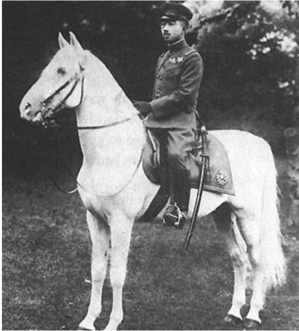
Emperor Hirohito as supreme commander