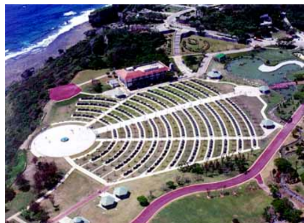
Cornerstone of Peace Memorial to Battle of Okinawa

Published in 1996, the program guide for the Okinawa Prefectural Peace Memorial Museum explains, "These deaths must be viewed in the context of years of militaristic education which exhorted people to serve the nation by 'dying for the for the emperor' ( Tenno no tame ni shinu )." [4] Okinawans cite the role of emperor-centered indoctrination of unquestioning self-sacrifice not only in compulsory group suicides, but also in many other deaths among the more than 120,000 local residents who lost their lives in the only Japanese prefecture subjected to ground fighting. [5] They also point to recently released documents showing that the Battle of Okinawa could have been avoided if the Showa emperor had not decided in early 1945 to prolong the war, rejecting the advice of former Prime Minister Konoe Fumimaro to end it immediately. [6]