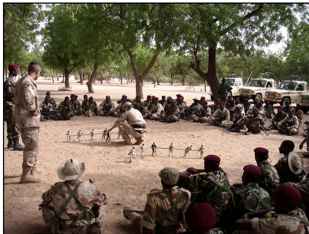
US forces in Chad use GI Joe toys to demonstrate counter-terrorist tactics in July 2005