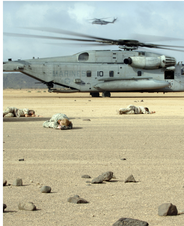
US Marines in action in Djibouti, Feb 2006

In the Horn of Africa, Centcom now has a substantial permanent base at Camp Lemonier in Djibouti, with around 1,800 troops based there for operations in the Horn and east Africa more broadly. In the extensive campaign against the Islamic Courts Union movement in Somalia in December 2006-January 2007, US units worked closely with the Ethiopian and Kenyan governments to remove the courts from the capital, Mogadishu, and conduct attacks on the movement's alleged al-Qaida associates. These involved air operations conducted from a base in Ethiopia, and special-force units moving into Somalia from across the Kenyan and Ethiopian borders.