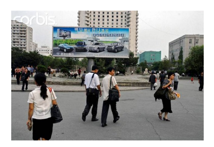
North Korean workers as billboards of capitalism

Anticipating this detrimental development, the North started cooperation with the South on the precondition of switching workers once a year. But switching workers every year was impossible for technical reasons. Inevitably rumours about life in South Korea started circulating among KIP workers and their families. It seems that illusions about the South became so widespread that the authorities found the situation intolerable. From the KWP's point of view, each worker in Mt. Kumgang and Kaesong was like a poster advertising capitalism.