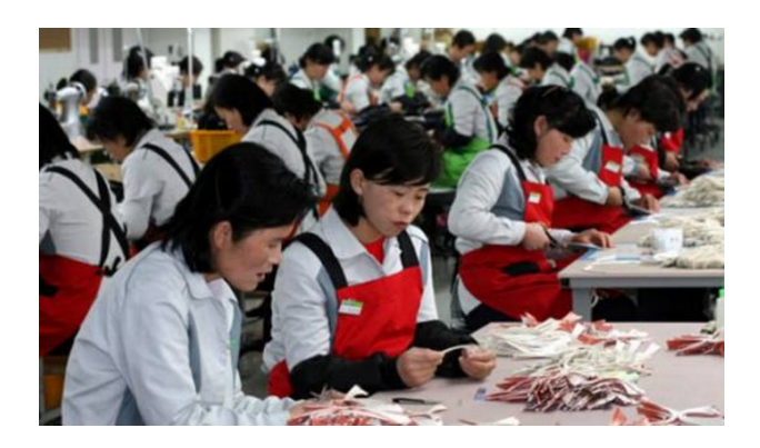
Kaesong workers 2009

Stricter discipline was enforced and stringent sanctions applied against violators. The DPRK also blocked all ROK publications from entering the country. In the past, the DPRK permitted 20 newspapers from nine publishers to be brought over the demarcation line on a regular basis to be read by ROK employees working at the Kaesong Industrial District Management Committee (KIDMAC). "The decision can be seen as extending the ban that had been in place for ordinary people to KIDMAC employees", concluded the Korean Herald [18]. However, this tightening of screws was only a prelude to the real crisis.