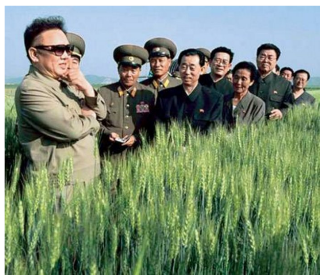
Army-First Politics: Kim Jong-il's on the spot guidance

waiving many restrictions, including those on private trade and travel. In the meantime, border control with China loosened to the point that a few hundred thousand economic migrants rushed to the neighbouring Korean Autonomous Region of the People's Republic of China (PRC). In other words, in the last years of the 20th century, the old "Stalinist" system of North Korea was breaking down and a new market-oriented system began to grow in its place.