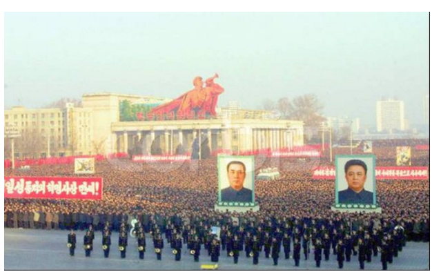
150-Day Battle mass campaign

and truly over and North Korea seems to be heading back in the direction of military communism. Only those elements of market economy which are necessary to keep the country afloat are being preserved.