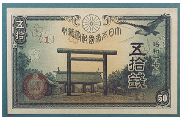
Shrine on 50 sen bill, 1943.

Another kind of alchemy goes hand in hand with the alchemy of exaltation. This is the alchemy of amnesia . . . forgetting atrocities and war crimes, forgetting the treatment of the military comfort women, of forced laborers, of those whose lands were invaded, homes destroyed and families slaughtered in the name of emperor and empire. While the military dead were enshrined as kami at Yasukuni shrine and their families received state pensions, the hundreds of thousands of civilian dead and many more injured were forgotten: neither shrine nor state commemorated their sacrifice or attended to the needs of their families. If nationalism has everything to do with invented tradition, as Benedict Anderson has compellingly argued, it is equally about suppressed or forgotten traditions.