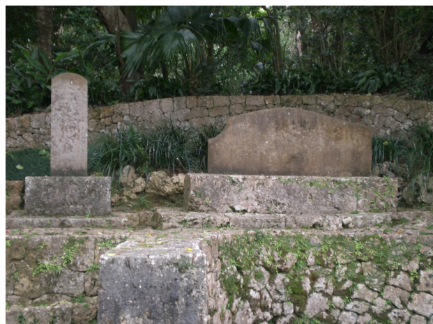
Monuments at Shikina

If Konpaku was the creation of Okinawan villagers, Shikina was primarily the product of GRI (that is, the US administration of the Ryukyu Islands) under pressure from Tokyo. Yet we cannot simply conclude that Konpaku embodied Okinawan sentiment while Shikina was the expression of Tokyo and/or the US. Both sites honored the military and the civilian dead, Japanese and Okinawan, although as we will note, with quite different emphases.