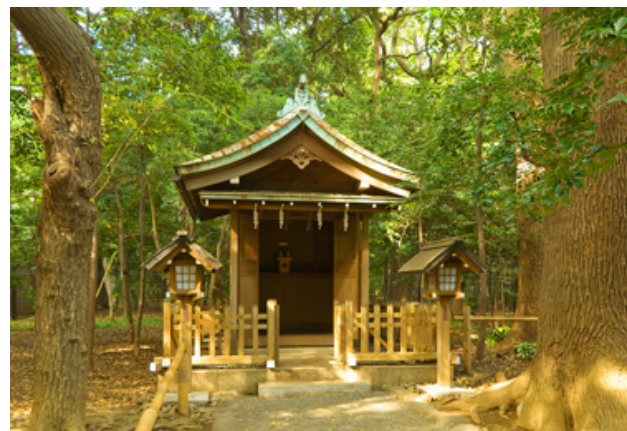
Chinrei-sha, Spirit-pacifying shrine

compact to secure the compliance of soldiers and civilians to fight and die for goals proclaimed by the state. [4] If the symbolism of Yasukuni is distinctive in its particulars, it is but one such manifestation of a global phenomenon of state-sponsored war nationalism pivoting on the military war dead. With the enshrinement of Japan's 2.46 million military dead, the senbotsusha , that is, all who died in uniform from Meiji through the Pacific War (2.1 million in the Pacific War), Yasukuni reinforced its position as the central symbol linking emperor, war, the military and empire. John Breen's sensitive analysis of the shrine's rites of apotheosis and propitiation well documents the nexus of power and ideology that gives the shrine its special place in contemporary Japan. [5]