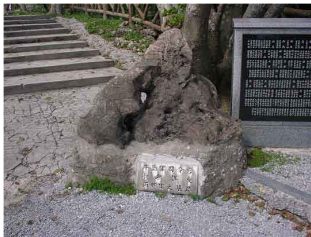
Memorial to Ushijima and Cho

The Japanese government, displaced from Okinawa by US forces, worked to lay claim not only to the souls of mainland Japanese soldiers who died, but also to those of Okinawan soldiers and even civilians. USCAR documents record the fact that in January 1964 “the Japanese cabinet decided to confer court ranks and decorations posthumously to World War II war dead, including approximately 52,700 Ryukyuan (Okinawans).” [10]