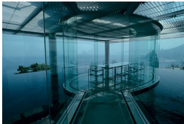
Making a connection: Kuma Kengo's 'Water/Glass' structure in Atami, Shizuoka Prefecture, attempts to connect architecture with the sea by means of a veranda of water.

"I wanted to go to a place that wasn't neat and tidy, somewhere dangerous. I was bored, and it had something to do with the era and something to do with myself too."