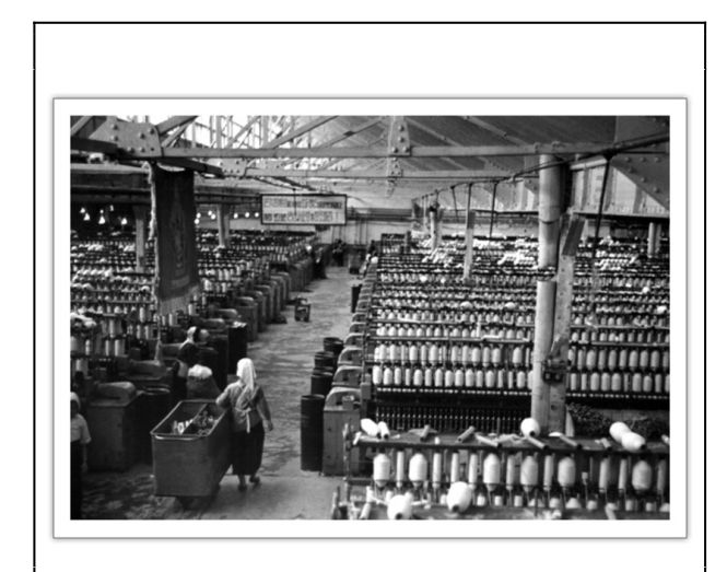
Pyongyang cotton mill, 1955

the country carried out a series of major social reforms including free primary and secondary school education, state-sanctioned equal rights for women in workplaces, state-subsidized medical services, and a welfare system for war invalids and the families of the fallen. It was against this background of successful mass mobilization that the famous Cambridge economist Joan Robinson, after her visit to Pyongyang in October 1964, wrote a report called "Korean Miracle." Robinson praised "the intense concentration of the Koreans on national pride" in North Korea's social economic development, led by the country's leader Kim Il Sung, who was "a messiah rather than a dictator."<sup>[1]</sup>