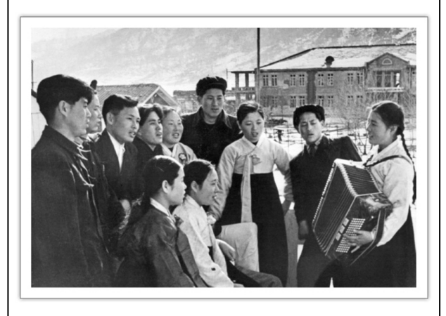
Workers' sanatorium, Wonsan, 1955