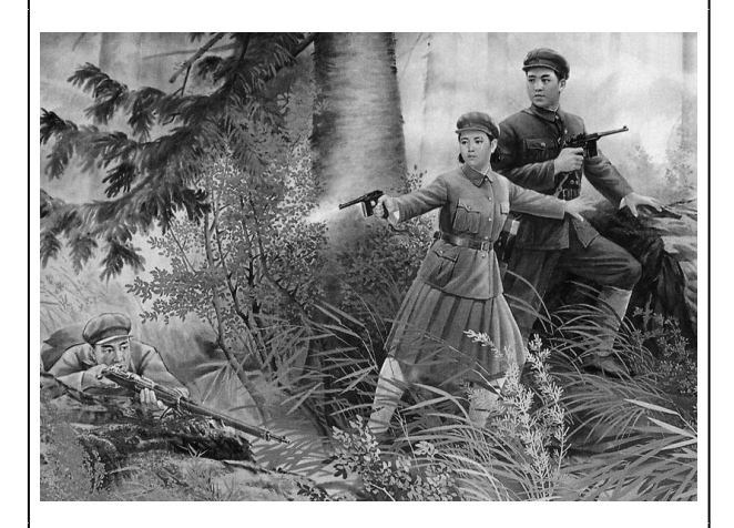
Defend the Leader!, painting

The barrel-of-a-gun of military-first politics