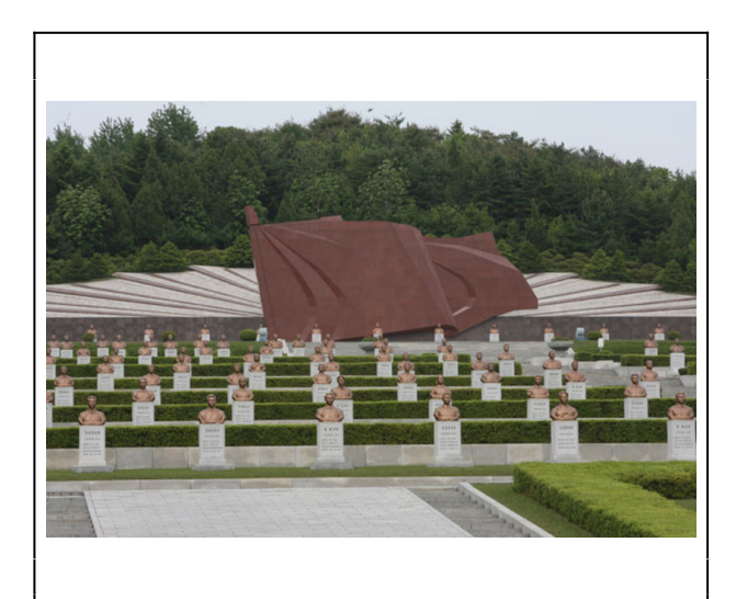
Cemetery of Revolutionary Martyrs

the place should be a burial ground for North Korea's fallen soldiers of the Korean War. That is far from the case, however. North Korea has no state-instituted, recognized public cemeteries for the fallen soldiers in the Korean War, although it has a number of epitaphs, memorials, and museums dedicated to their memories. In fact, North Korea's national cemetery has no trace of the country's collective Korean War experience or of the tremendous mass sacrifice to that brutal, protracted civil and international war. Instead, the cemetery is reserved exclusively for a particular cohort of national heroes from a prewar history and from the era many years before North Korea existed-the so-called first generation of Korean revolutionaries, which refers to the members of Kim Il Sung's Manchurian partisan group in the 1930s.