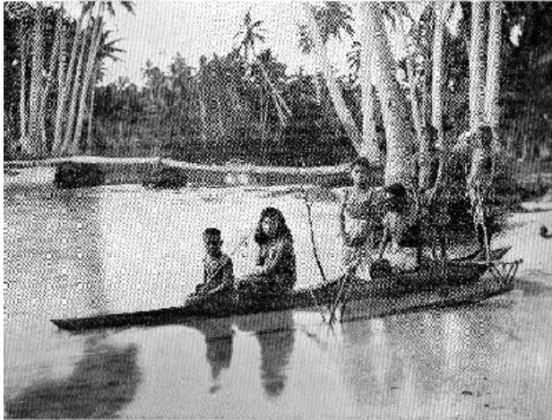
"Natives and canoe, Savai'i", under "Samoa" in The World of Today , Volume 4, 1907, p. 187.