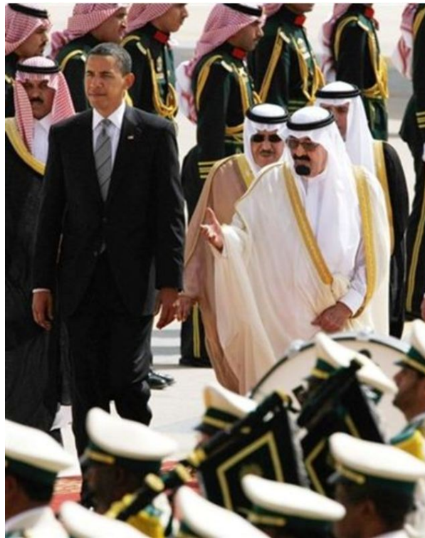
Obama with Saudi King Abdullah, 2010

In short, the wealth generated by the Saudi-American relationship is funding both the al Qaeda-type jihadists of the world today and America's self-generating war against them. The result is an incremental militarization of the world abroad and America at home, as new warfronts in the so-called War on Terror emerge, predictably, in previously peaceful areas like Mali.