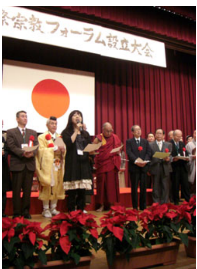
His Holiness and others celebrating the Interfaith Forum held in Ise, Mie Prefecture, last month.

On a global level, now the northerners, the industrialized nations, have too much consumerism and surplus. In other parts of the world, like Africa, Latin America, and also Asia, the basic necessities are not adequate and in some cases, starvation also exists. It is really terrible. So this gap is not only morally wrong but on a practical level is the source of problems. Now European countries, America, Australia and Japan are facing the problem of (unmanageable levels of) immigration.