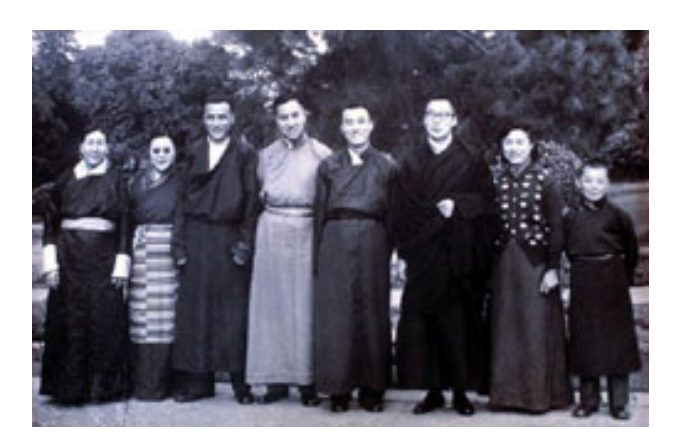
His Holiness (below, third from right) in exile in India in the early 1960s, photographed with his mother (far left), his older sister (second left), his three

Now the environment issue. Of course, I learned about the environment issue only after I went to India. When I was in Tibet, everything was very pure. I think the nature of god purified our air, our water, our soil. (Laughs heartily.)