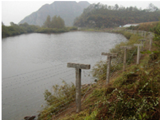
Dandong. Barbed wire fence separates China from North Korea (left)