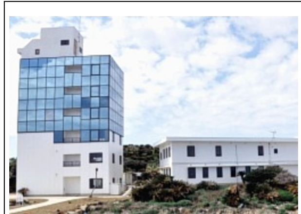
“Beyond the Law” Tasuton Airport Buildings, Mage Island February 2010

presumed to be staff quarters, 12 keen also to investigate apparent breaches of various laws including the Forest Law and to survey the deer population because of suspicion of its drastic decline.