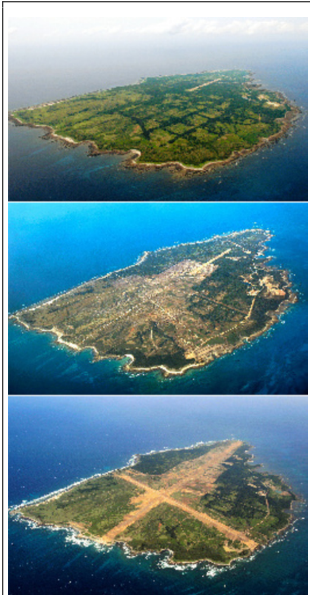
showing apparent breach of forest law by unlicensed development From top down, the island in June 2004, November 2006, and July 2011

comparable to Tokyo's Narita or Osaka's Kansai emerged on the uninhabited island. 4