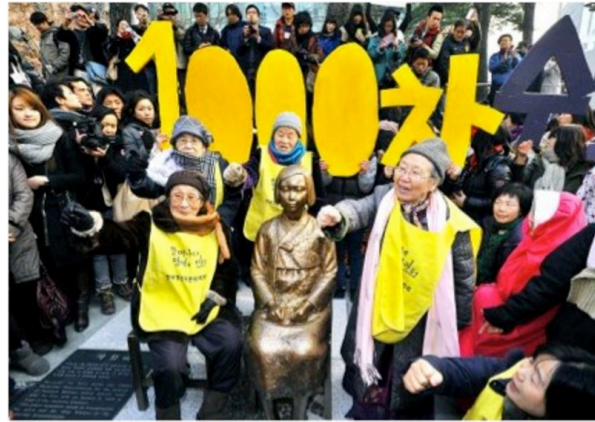
Comfort women in Seoul on the 1000 th demonstration in front of the Japanese Embassy.

statues might be erected if Japan failed to resolve the issue. At present, the issue remains stalemated at a time when Japan-ROK relations are tense as a result of territorial conflict over ownership of the Dokdo/Takeshima islet.