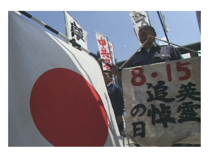
Former soldiers at Yasukuni on August 15, the anniversary of Japan's surrender in 1945.

â€"In a now familiar pattern, ultra-nationalists who follow in the shadow of establishment politicians, threatened retribution against anyone who handled the movie. Anonymous bloggers posted contact details for the distribution company, the Japan Arts Council and every theatre showing it. Anonymous death threats have been issued against Dragon Films, the company that produced "Yasukuni."