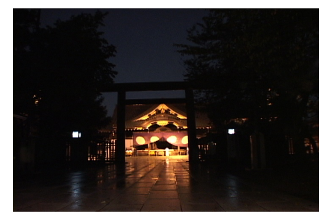
Yasukuni shrine at night.

Its name translates as "peaceful country," millions have silently prayed there for an end to wars, and for much of the year the loudest sound is the buzzing of insects and the shuffle of old footsteps to the hushed main hall. Yet Yasukuni Shrine, which occupies a single square kilometer of central Tokyo, is one of the most controversial pieces of real estate in Asia, resented by millions who consider it a monument to war, empire, and Japan's unrepentant and undigested militarism.