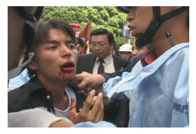
Protester beaten and taken by the police.