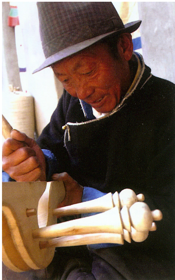
Tibetan artisan at work

confirms anecdotal evidence from local employers that Tibetans and other minorities can get jobs if they have the right skills.