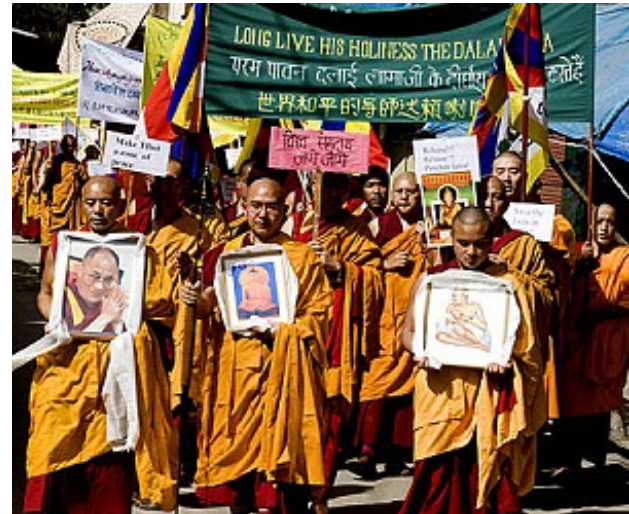
Tibetan monks in Dharamsala, India pray for demonstrators in Tibet, March 18, 2008

Certainly, Tibetan exile flags and "free Tibet" slogans were features of Tibet's biggest and most violent protests in decades, but it is simplistic to see the widespread discontent on the Tibet Plateau as a bid for freedom by an oppressed people. Protests in Lhasa began with Tibetan monks using the anniversary of the Dalai Lama's flight into exile (March 10, 1959) to peacefully demonstrate against tight religious controls, including patriotic education campaigns and forced denunciations of the Dalai Lama, but they were soon joined by ordinary Tibetans who used violence against non-Tibetans and their property. Victims included Muslim traders as well as Han Chinese.