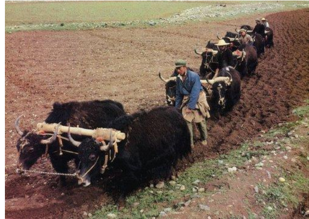
Tibetan farmers ploughing with yaks

Because of the rosy picture painted by official statistics and the state media, most Chinese are unaware that Tibetans have been among the big losers in the course of China's economic miracle, and that within Tibetan areas (both the Tibet Autonomous Region and Tibetan autonomous prefectures in the neighboring provinces of Qinghai, Gansu, and Sichuan), the pace of economic modernization has polarized Tibet's economy. While a minority of Tibetans have been rewarded with state jobs, the majority of Tibetans, who are poorly equipped to access new economic opportunities, have been marginalized.