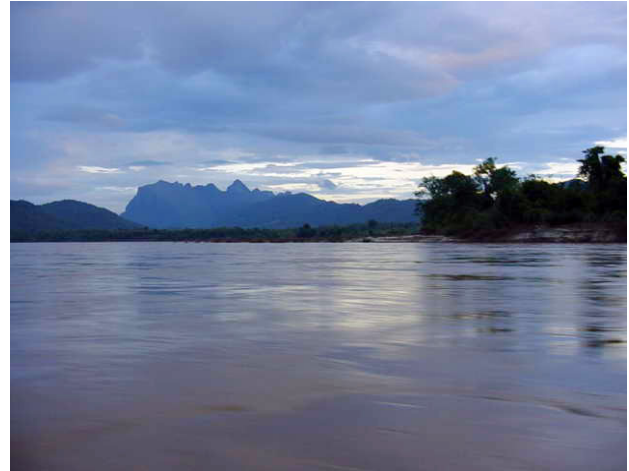
The Mekong in Laos

CHIANG MAI - As Mekong River floodwaters in Laos and Thailand recede, indignation with China for its lack of transparency on upstream dam developments is on the rise. China has recently pursued a friendly policy of economic integration with Southeast Asian neighbors but in relation to Mekong River development it has taken what many see as a covetous and less than neighborly approach.