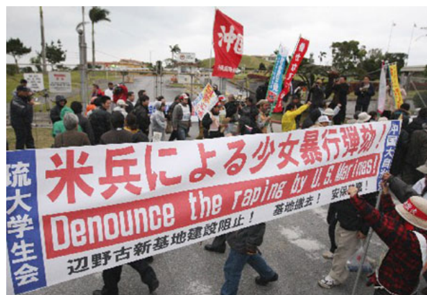
Okinawan protest at Marine Headquarters in Kita Nakagusuku village following news of the rape

Once an incident "blows over", as this latest one now has, the pundits and diplomats go back to their boiler-plate pronouncements about the "long-standing and strong alliance" (Rice in Tokyo), about how Japan is an advanced democracy (although it has been ruled by the same political party since 1949 except for a few years after the collapse of the Soviet Union), and about how indispensable America's empire of over 800 military bases in other people's countries is to the maintenance of peace and security.