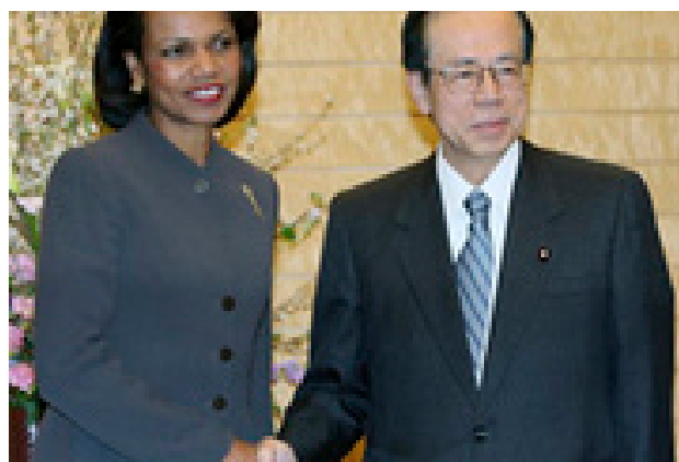
Secretary of State Rice expressed "regret" in meeting with Prime Minister Fukuda

Occasionally the remorse goes up to the Pacific commander-in-chief or, in the most recent case, to the secretary of state. On February 27, Condoleezza Rice said, "Our concern is for the girl and her family. We really, really deeply regret it." The various officers responsible for the discipline of US troops in Japan invariably promise to tighten supervision over them, who currently number 92,491, including civilian employees and dependents. But nothing ever changes. Why?