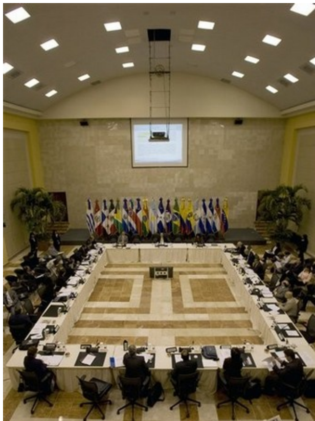
Rio Group meeting 2008

American and Caribbean countries, in which the U.S., Canada and the European powers were not invited. Every single head of state came, with two exceptions. Who were the two exceptions? Columbia and Peru -- two, currently, mostly pro-American countries. But also, they didn't boycott it. They sent a number two or number three. Even Mexico came. Of course, Raul Castro was there, who was the hero of this meeting. They took very strong positions and the U.S. was absolutely out in the cold.