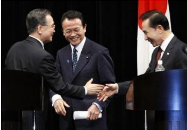
Chinese (left), Japanese and Korean leaders at the summit

Everybody is worried about that in the United States, in China, in South Africa, in Germany. Everybody is worried that they're going to have something like what happened recently in Greece -- a spontaneous uprising of angry people. That's very hard for governments to deal with. When people are a little bit angry, which is what is basically happening now, they get even angrier. All the governments are trying to appease them. OK, fine. That's what he can do. He will do things domestically. He will spend money on building bridges, which gives jobs. He will try to get a new health program through that will cover people. All good things, but they're national things, they're local things. They're the same kind of good things that other leaders are trying to do in their countries. If he recognizes his limitations, he could be a great success. If he doesn't recognize his limitations, he could be dragged into something.