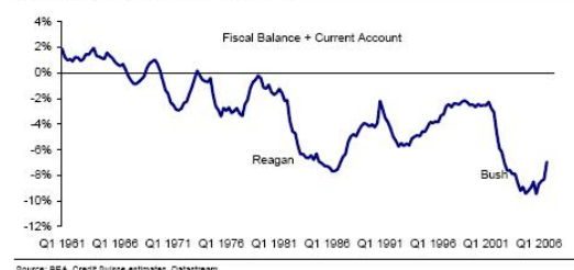
Exhibit 3: US "Twin Deficits" Combined

The new mechanism is the U.S. government and the U.S. consumer. That is the '90s and 2000s. That is to say, we get the U.S. government under Bush becoming indebted. You get the consumer becoming highly indebted, which then gives way to a symbiotic relationship with China and a number of other countries, including Korea, who invest their money in treasury bonds. That creates this incredible situation where the U.S. is totally dependent on the loans, but loans have to be repaid at some point. We're at that point right now. Countries like China -- of course, not only China, it's just the one most talked about, it's true of Norway, it's true of Qatar -- are in this delicate situation where on the one hand they want to sustain the United States so they continue to buy their products and on the other hand the money that they've invested is losing value all the time because it's in dollars. And the dollar is going down. So, it's two curves that cross. You've got to lose more one way or the other.