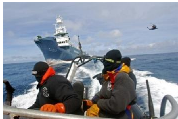
Japanese whaler Yushin Maru watched by Sea Shepherd members in a speedboat

This came several days after Chief Cabinet Secretary Machimura Nobutaka announced that Japanese prosecutors will seek international arrest warrants through Interpol for three Sea Shepherd members for their activities against Japanese whaling in the Southern Ocean in 2007. [34]