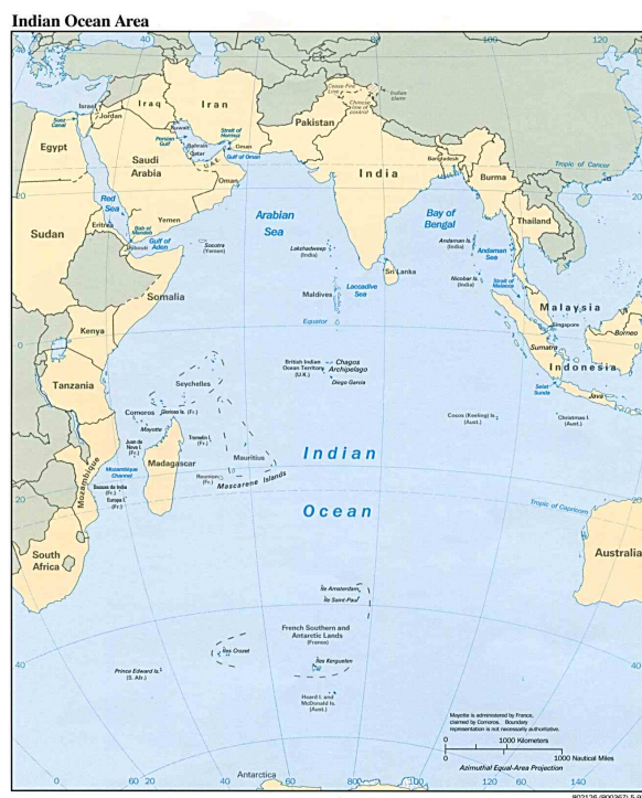
Indian Ocean map