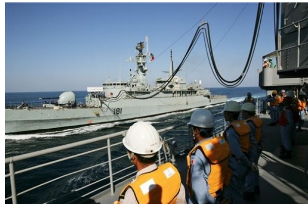
MSDF crew watch refuelling of a Pakistani ship in the Indian Ocean on October 29, 2007

and the surrounding region in November 2001. [8] After the expiry in November 2007 of the original legislation authorising the MSDF mission, the Replenishment Support Special Measures Law in January 2008 passed the lower house for the second time on January 11, 2008, in order to open the way to "contributions to efforts by the international community for the prevention and eradication of international terrorism." [9]