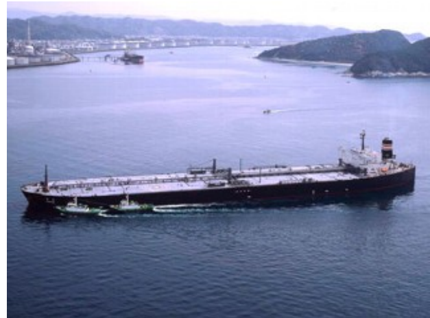
Japan oil tanker Takenaka was attacked off the coast of Yemen in April 2008

and, when that possibility appeared unlikely to succeed, deploying MSDF destroyers and surveillance aircraft to protect Japanese tankers from pirate attacks on the route from Middle Eastern oil terminals.