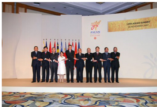
The 13th ASEAN Summit meeting held in Singapore in November 2007

The 2005-07 spike in petroleum prices topping out at $100 a barrel has prodded economic planners across the globe to reconsider their energy options in an age of growing concern over global warming and carbon emissions. The Southeast Asian economies, themselves beneficiaries of an oil and gas export bonanza through the 1970s-1990s, also find themselves in an energy crunch as once ample reserves run down and the search is on for new and cleaner energy supplies. Notably, regional leaders at the 13 th ASEAN Summit meeting held in Singapore in November 2007 issued a statement promoting civilian nuclear power, alongside renewable and alternative energy sources. ASEAN--which in 1971 endorsed a nuclear-free zone concept--also sought to ensure that plutonium did not fall into the wrong hands through the creation of a "regional nuclear safety regime." In response, environmental activists across the region cited concerns over nuclear power, citing safety and unstable regional geologies concerns. [1] Undoubtedly they were taking a cue from Japan's recent nuclear disaster. [2] Singapore, host of the ASEAN summit meeting, made known its concerns.