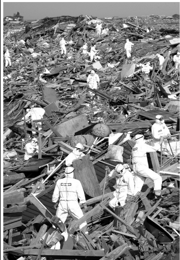
300 Policemen in NBC Suits Search Victims Near Namie Town.