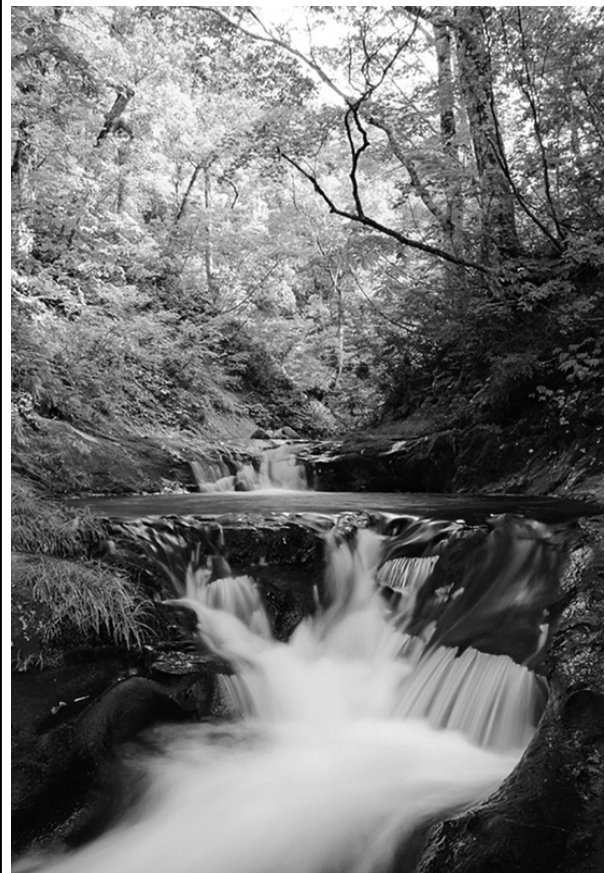
A beech forest in Tadami Town.

Abe Ryūsei, an elementary-school pupil, wrote this haiku in an impromptu haiku session with Mayuzumi. It reads like a natural, conversational utterance. But it fulfills the traditional haiku requirements of the set form of 5-7-5 syllables and the inclusion of a seasonal word.