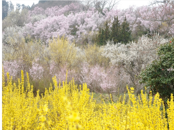
Viewing cherry blossoms.