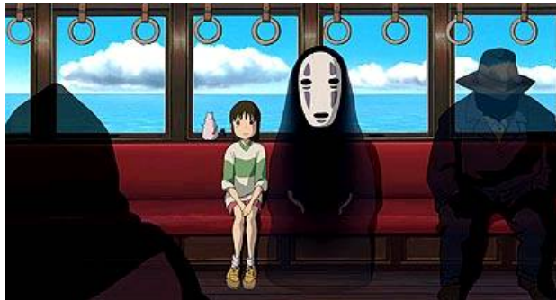
A scene from Spirited Away

both emotionally precise and fantastical. It's like every solitary journey you've ever taken, when you felt lonely and a little exalted, but it is also deeply strange, for the train glides, stately and surreal, over a translucent blue sea, while the sky slowly ripples through the possibilities of a sunset, from the pink of crushed petals to a soft, forgiving black.