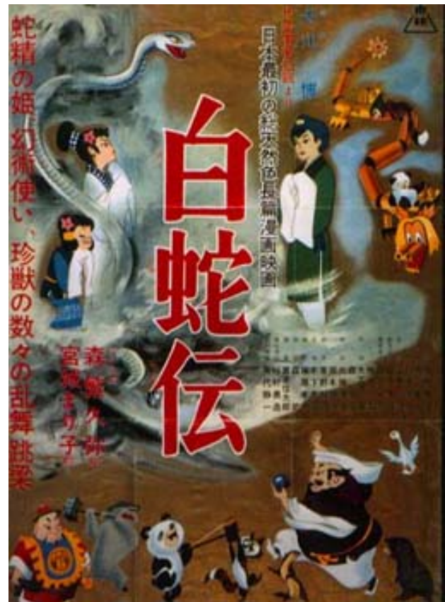
Poster for Legend of White Snakes

him. "My soul was moved and I stumbled back home in the snow that had just started. Comparing my pitiful situation to the characters' earnestness, I was ashamed of myself, and cried all night." At the time, he had been trying to write a sophisticated, absurdist manga, but he realized, somewhat to his embarrassment, that he was more interested in creating something sincere.