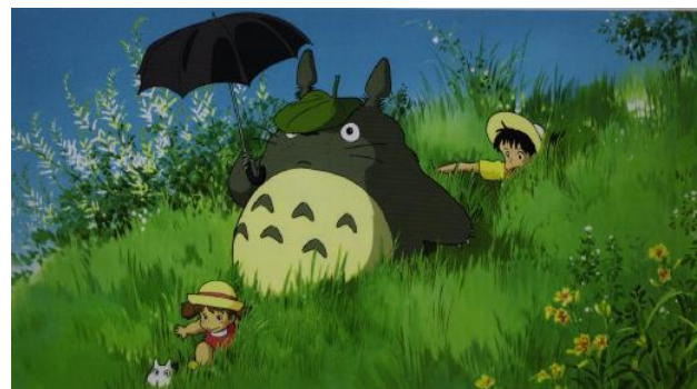
A scene from My Neighbor Totoro

Satsuki, are not idealized; they are at once goofy, brave, and vulnerable, like a lot of kids. The sisters have just moved with their father to a new house in rural Japan. Gradually, the two girls discover a host of strange but benign woodland creatures: fuzzy little soot sprites that hang out in old houses and hide when you turn on the lights; the plump, whiskered Totoros, who live in the roots of a giant camphor tree; and the marvelous cat bus, with its headlight eyes, caramel-colored stripes, and extra legs that function as wheels. (In a 1993 televised discussion between Miyazaki and the director Akira Kurosawa, Kurosawa mentioned how much he admired the sweetly surreal cat bus.) There is a gentle hint of Shintoism in all this: the father, an anthropologist, respectfully accepts the notion that the forest is presided over by spirits, though he is no longer able to see them, as his children can. Unlike the animals in most American cartoons, these creatures are not excessively anthropomorphized; they don’t speak, which somehow makes them seem both more plausible and more dignified, and which gives the girls the delightful challenge of interpreting them. In fact, the film is focused on dignifying the girls’ imaginations, honoring their ability to partake in a fantasy that is both comforting and fortifying—for we gradually learn that they are separated from their mother, who is ill and in the hospital.