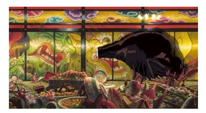
Chihiro encounters No Face in Spirited Away.