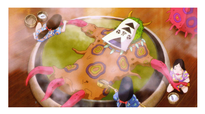
A scene from Spirited Away

Miyazaki began his animation career in the nineteen-sixties, at a time when the economic miracle that had swiftly transformed postwar Japan into one of the strongest economies of the world was, almost as swiftly, obliterating its countryside. In the nineteen-eighties, the government cleaned up the worst industrial pollution, but Japan is still a country where developers (especially golf-resort planners) have free rein, where most people prefer nature in tamed and miniaturized form (bonsai, Zen gardens, lavishly packaged tiny melons), and where few places are untouched by commerce (there are vending machines on Mt. Fuji). "Spirited Away" contains a memorable scene in which a gloppy-looking creature—the spirit of a polluted river—comes to a bathhouse to be cleansed; a lot of dirty, foul-smelling labor is required. For this sequence, Miyazaki drew on his own memories of cleaning up a river—and pulling things like bicycles out of the muck.