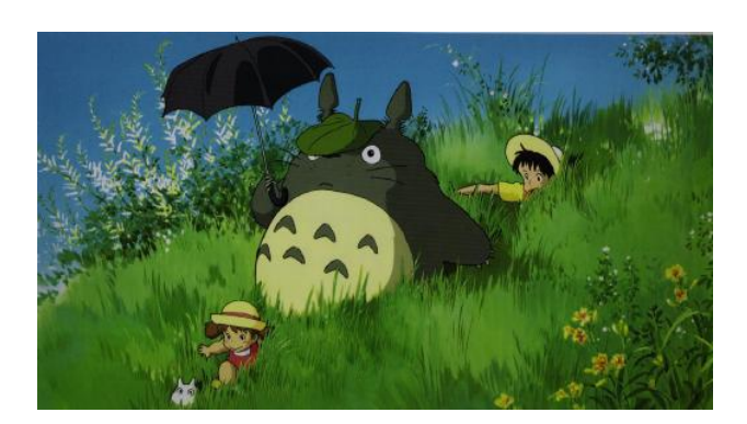
A scene from My Neighbor Totoro

Satsuki, are not idealized; they are at once goofy, brave, and vulnerable, like a lot of kids. The sisters have just moved with their father to a new house in rural Japan. Gradually, the two girls discover a host of strange but benign woodland creatures: fuzzy little soot sprites that hang out in old houses and hide when you turn on the lights; the plump, whiskered Totoros, who live in the roots of a giant camphor tree; and the marvelous cat bus, with its headlight eyes, caramel-colored stripes, and extra legs that function as wheels. (In a 1993 televised discussion between Miyazaki and the director Akira Kurosawa, Kurosawa mentioned how much he admired the sweetly surreal cat bus.) There is a gentle hint of Shintoism in all this: the father, an anthropologist, respectfully accepts the notion that the forest is presided over by spirits, though he is no longer able to see them, as his children can. Unlike the animals in most American cartoons, these creatures are not excessively anthropomorphized; they don't speak, which somehow makes them seem both more plausible and more dignified, and which gives the girls the delightful challenge of interpreting them. In fact, the film is focused on dignifying the girls' imaginations, honoring their ability to partake in a fantasy that is both comforting and fortifying—for we gradually learn that they are separated from their mother, who is ill and in the hospital.