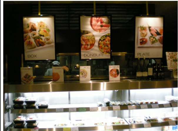
Some of the sushi available at Genji’s counter

All seats are non-smoking, which is rare for a Japanese restaurant. 16 There is a takeaway glass-fronted display with salads, sushi sets, and other “healthy” foods displayed. The signage is in English only, and the items on the menu, written in English, have descriptions in Japanese. The menu includes a vast array of fusion sushi and donburi (rice with topping) – California Don, Tuna and avocado Don, Genji seafood salad, etc., with prices set at modest levels. The average cost of a single meal “set” was around 1,000 yen. There were only two employees in the entire restaurant with seating for about 30, so service was negligible, reflected in the price of the food perhaps.