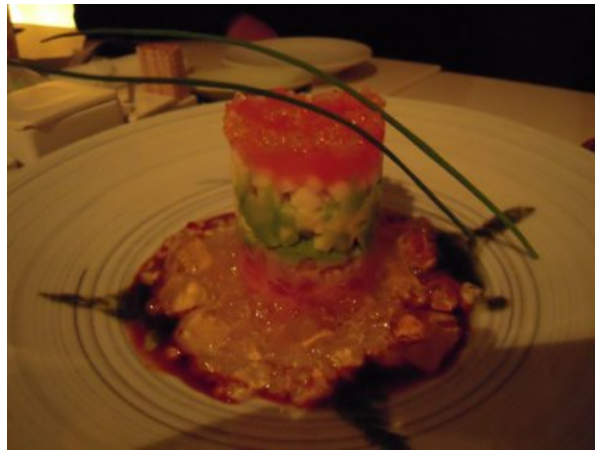
Rainbow Roll Sushi's tuna and avocado stack