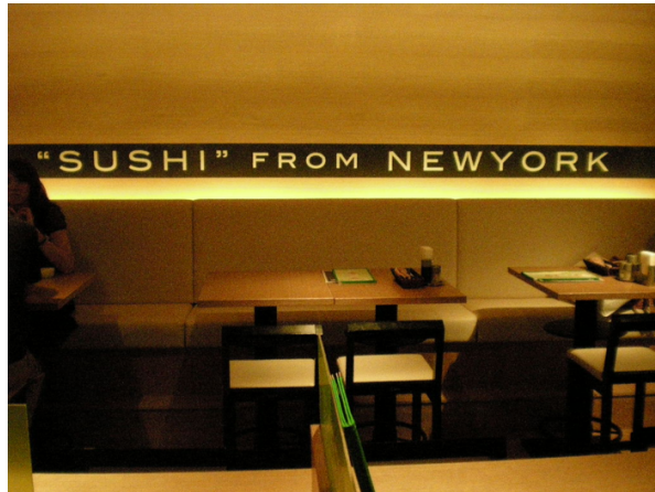
Note the quotation marks around “sushi” and the emphasis on New York in the signage

All seats are non-smoking, which is rare for a Japanese restaurant. 16 There is a takeaway glass-fronted display with salads, sushi sets, and other “healthy” foods displayed. The signage is in English only, and the items on the menu, written in English, have descriptions in Japanese. The menu includes a vast array of fusion sushi and donburi (rice with topping) – California Don, Tuna and avocado Don, Genji seafood salad, etc., with prices set at modest levels. The average cost of a single meal “set” was around 1,000 yen. There were only two employees in the entire restaurant with seating for about 30, so service was negligible, reflected in the price of the food perhaps.