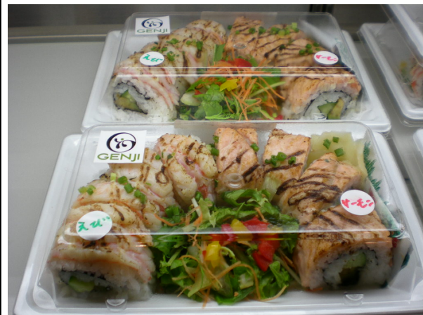
Genji's seared salmon rolled sushi with salad

some donburi (rice with in this case rather unconventional toppings) items such as California-don (raw tuna 17 and avocado) or donburi with organic green onion and raw tuna salad. Genji's main selling points are that it is “New York” sushi – it is the sushi that people in New York eat – and that the food it sells is healthy and stylish. In a slightly ironic twist, the chain has employed the same marketing strategy employed overseas to sell this overseas variant of sushi to Japanese; that is, it has emphasised the “healthy” aspect of eating their particular kinds of sushi to an extent almost never seen in Japan. Arguably, within Japan sushi is not perceived as particularly “healthy.” Rather it can be perceived as convenient, cheap, accessible, familiar, or expensive, distinctive and bought for special occasions etc. But the population generally does not need to be educated to eat sushi (ultimately it is simply a matter of choice, unlike in other nations, where marketing strategies may involve educating customers that eating sushi is a rational, healthy, and economic choice).