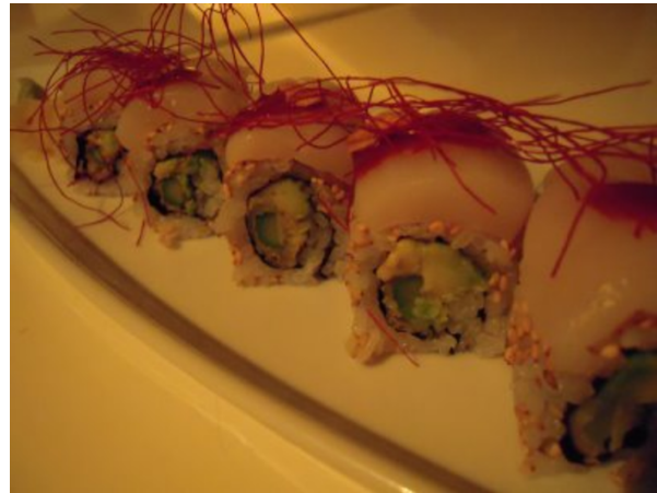
Rainbow Roll Sushi's spider roll

There is a substantial central table made of backlit marble, around which perhaps 20 diners can be seated, there are semi-enclosed split-level zashiki (Japanese-styled tatami mat booths) that overlook the central table, and there are seats available at a sushi bar. With the dim lighting, the panopticon-like views from the central dining table over the restaurant, the monochromatic décor, the Latin American sound track, and the subdued but lively buzz of conversation from the partially sound-shielded booths, the restaurant would not be out of place in New York, London, Rio or Sydney. Staying with the theme of discreet sophistication, most of the food preparation is conducted behind the sushi bar, in a kitchen that is not visible to customers. Sushi chefs do make sushi at the bar, but they produce only rolled sushi; the more exotic sushi that involves items like seared scallops, cooked prawns, etc. is made in the kitchen, as it is in most sushi restaurants.