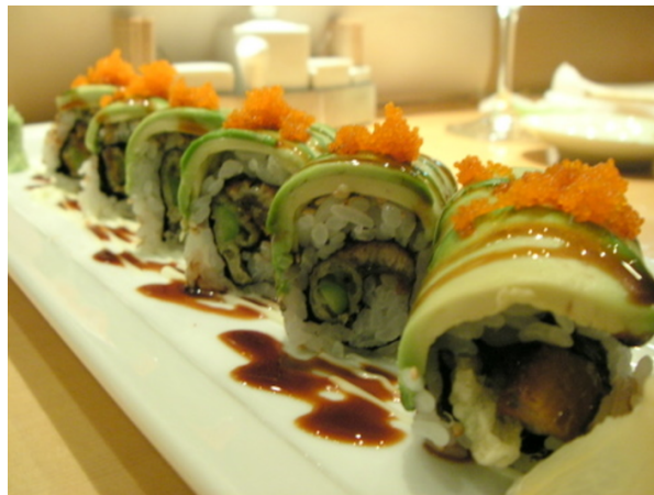
Rainbow Roll Sushi's dragon roll

into their menus in an environment that is quite dissimilar to most sushi restaurants in Japan. Clearly, too, the names of the respective restaurants are relevant in determining their clientele and their products: Rainbow Roll Sushi, written in English and in katakana, unsurprisingly makes and sells a large range of unusual roll sushi. In addition to “standard” American sushi like California Roll or Dragon Roll, they offer an array of original roll sushi with interesting and unexpected combinations of fillings such as fried aubergine, shrimp, jalapeno mayo, raw beef, kim-chee, in very unusual combinations.