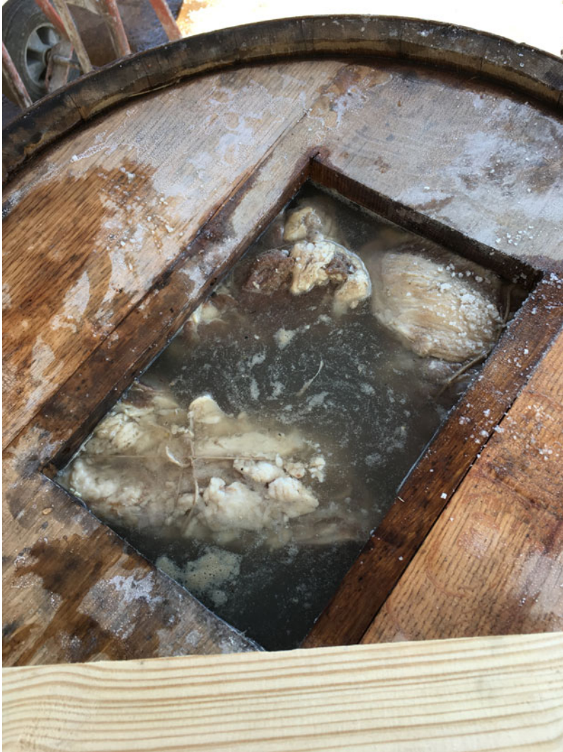
Figure 5. The beef cask after it was filled with brine.

The pig was obtained from Chubby Dog Farm and was a Mangalitsa–Tamworth heritage boar with a live weight of approximately ninety-one kilograms (two hundred pounds) and a hanging weight of sixty-eight kilograms (150 pounds). The instructions for salting pork are the same as for the beef, as indicated by Collins, 68 with the exception that pork was normally butchered into 0.9-kilogram (two-pound) slabs according to several ration lists and primary documents. 69 Otherwise, the same procedure for dry salting and brining the pork was carried out. Due to the smaller size, the meat was placed in a smaller oak cask (also seasoned and new), and a total of sixty pounds of salt was used for dry salting.