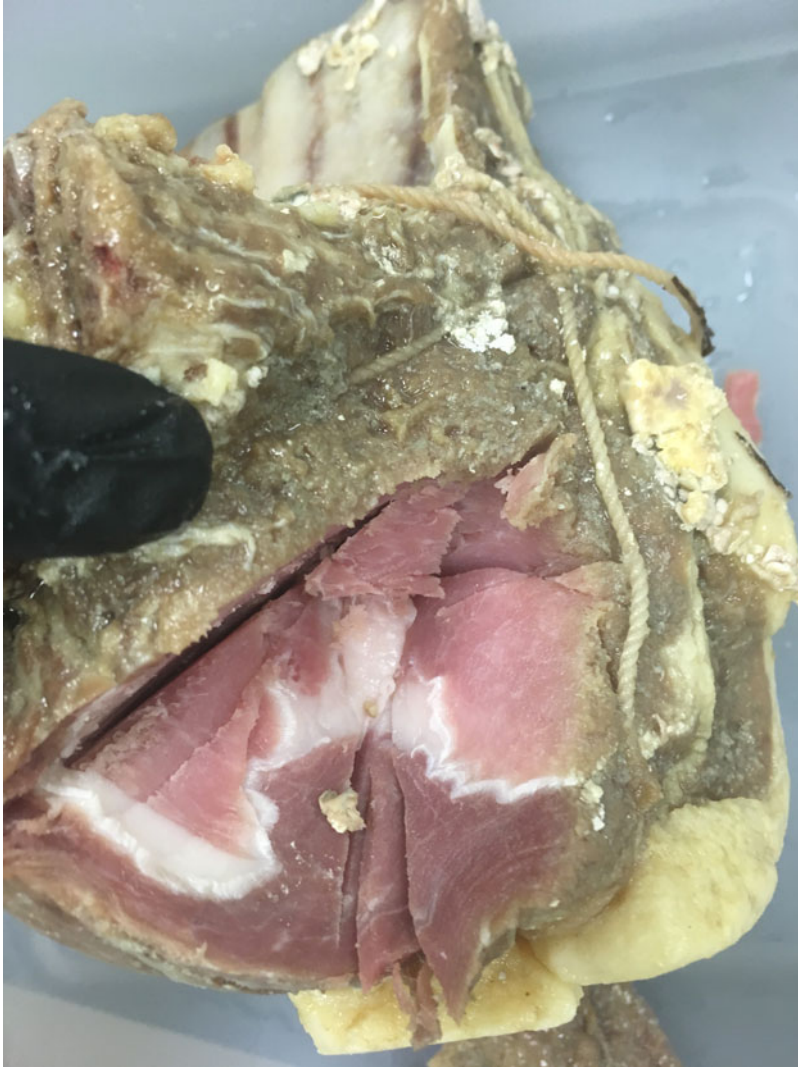
Figure 8. A slab of salted beef cut open to extract an internal sample for microbiological analysis. Notice the red and pink colouration.

Schneider and Yeary. 76 Nitrite concentrations were measured in standards and samples after diazo-coupling to sulphanilamide and N-1-Naphthyl ethylenediamine dihydrochloride. Using the stock, 0.6 mM sodium nitrite made up to ten millilitres with water was used to prepare the standard curve (standard curve 0, 5, 10, 20, 30, 40, 50, 60 micromolar ( \mu\text{M} ) concentration). Then 0.5 millilitre of sulphanilamide reagent was added to each tube, and three minutes were allowed to pass before adding 0.05 millilitre N-1-Naphthyl ethylenediamine dihydrochloride reagent. The solution was mixed, and twenty minutes were allowed to pass before they were read at 540 nanometres.