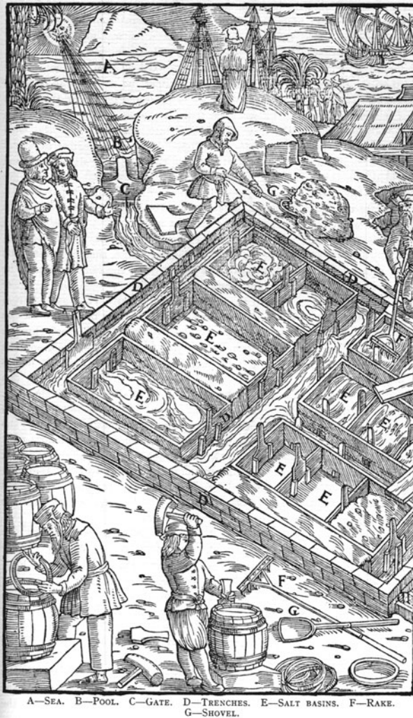
Figure 1. Agricola's illustration showing bay salt production. Georgius Agricola, De Re Metallica (tr. H.C. Hoover), New York: Dover Publications, 1950, p. 547.

Even given the wide selection of salts available, the use of bay salt (generic solar salt, not specifically from France) in the English Navy during the seventeenth and eighteenth centuries is well documented in primary sources, and the consensus in existing historical studies is that bay salt was used because it was inexpensive to produce. 10 However, when historical sources are studied in depth, bay salt's persistent use throughout history, and people's adherence to it, suggest that its popularity may not be solely explained by economics, and its cultural and historical significance is more complex than existing historiography insinuates. This study explores potential reasons apart from economics that may explain bay salt's continued popularity through time, combining analysis of historical sources and methods from experimental archaeology. Experimental archaeology is an approach for filling gaps in our knowledge about the past which cannot be filled through other archaeological and historical research methods. It does so typically through