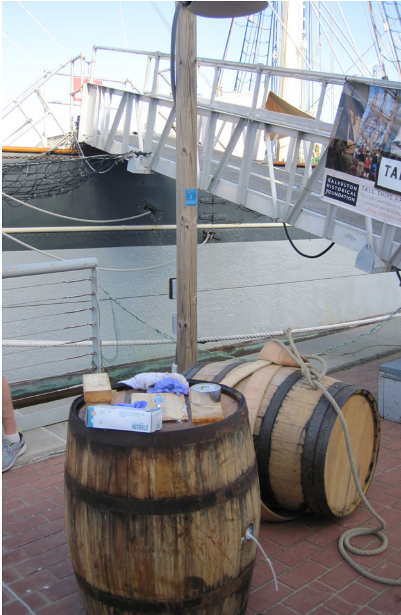
Figure 6. Loading casks onto Elissa .

reduces the risk of foodborne illness. 73 However, for this portion of the experiment, only the raw slabs of meat were used for microbiological, nitrate, nitrite and ammonia analyses. Meanwhile, the mineral analyses were run on the cooked meats as a part of the