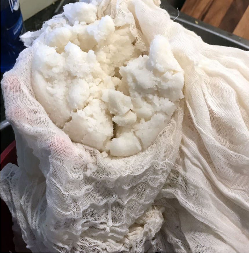
Figure 4. Newly formed sea salt crystals strained in cheesecloth for drying.

be common cuts on board seventeenth-century ships. These data were obtained from the project's zooarchaeological analysis of remains from Warwick , the seventeenth-century English galleon which sank off the coast of Bermuda in 1619, other shipboard faunal remains from archaeological reports, and primary historical documents. 67 The beef slabs were then laid in a new oak cask (seasoned) with a thick blanket of French Bay of Guérande salt. The layers of beef had a thick blanket of salt between them to thoroughly dry-cure the meat. No ratio was specified in the recipe, but the project used a total of about 86 kilograms (190 pounds) of salt on 118.2 kilograms of bone-in beef during the dry-cure process. After twelve days of dry salting, the beef was removed, excess salt was shaken off, and the meat juices that had gathered at the bottom of the cask were removed and boiled to produce brine. Meanwhile, more brine was made using natural untreated aquifer water that was saturated with bay salt until an egg could float in the solution. The beef was put back into the cask, and the cooled meat juices and brine were poured into the cask until it was topped off so that all the pieces were submerged, completing the pickling process according to the recipe (Figure 5).