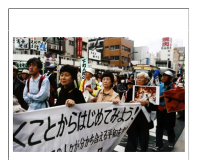
2009 Asakusa "Peace Walk"