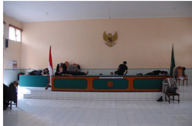
Protecting the Courthouse - Indonesian style

By the time I arrived, the courthouse had been cleaned of debris. Soldiers guarded the entrance, more than a dozen of them slept on the floor. I managed to sneak in. After some wobbly attempts to appear official and get to their feet, the soldiers fell back on their cartons spread on the floor. Heat and humidity overwhelmed them.