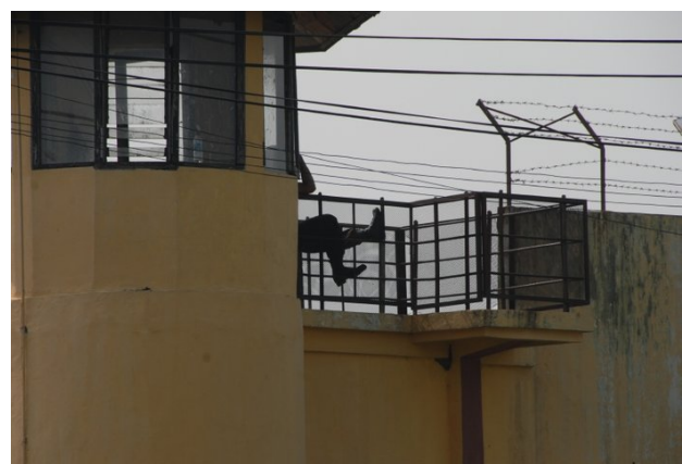
High security prison Porong, East Java, where some terrorists are doing time