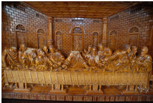
Decapitated Diners at Last Supper

And so it did, as I found out later, reading the pamphlet in the car that was driving me back to the city of Semarang. But 5 years in prison, or even perhaps the death penalty, for that badly written outpouring of bitterness, produced by someone who was apparently suffering from irreversible loss of faith?