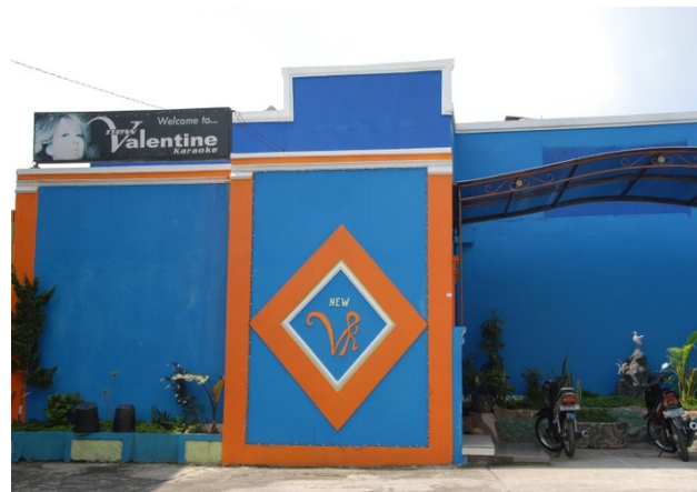
Vista near Bandungan

takes the badly marked shortcut from Bergas to Bandungan. Winding through stunning rice fields and bamboo groves, this road is beautiful but it would hardly please the piercing eyes of pious religious believers: its edges are dotted with one-hour hotels, karaoke clubs and pubs. In these parts of Central Java it is not uncommon to see lone sex workers descending from the hills along the road, in high heels and short skirts, still shaky after long nights of heavy alcohol consumption.