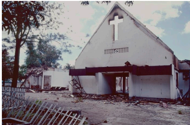
Lombok church burned down by Muslim extremists on January 17, 2000

for cameras. They see nothing wrong with their deeds. Recent release of the video of a tortured Papuan man (alleged a freedom fighter) is illustrative of the 'naive nature' of Indonesian brutality: the man had his genitals burned and soldiers were running a knife across his neck, but the military men merrily recorded their deeds, eventually passing the video on.