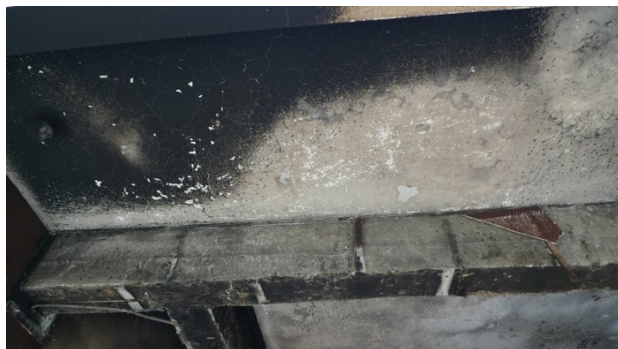
Burned Ceiling of One of the Temanggung Churches

Twice in the same week two gruesome attacks shook Indonesia and the world. On February 6, 2011, in Cikeusik Village, West Java - more than 1.000 furious Muslims lynched three members of a minority (or, as seen by some Muslims, 'deviant') Islamic sect Ahmadiyah. Two days later, on February 8 in Temanggung, Central Java, a crowd stormed a local courthouse and vandalized three churches after a man - a former priest who allegedly insulted both Islam and Christianity in his pamphlet - was sentenced to five years in prison, the maximum sentence. Protesters demanded the death penalty. A third attack soon followed.