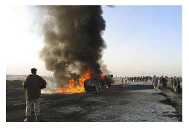
Burning oil tanker carrying fuel for NATO forces

Musharraf is sending Prime Minister Shaukat Aziz to NATO headquarters in Brussels on Tuesday. A NATO spokesman hailed the visit as "vitally important", and underlined that the visit will "deepen the political relationship between NATO and Pakistan".