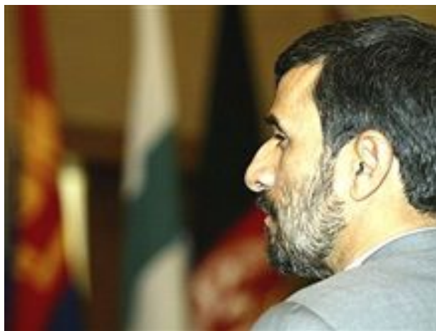
Pres. Mahmud Ahmadinejad of Iran at SCO meeting, July 2007

On March 24, Iran's official media reported that Iran will apply for full membership in the Shanghai Cooperation Organization (SCO), a would-be nascent EU-esque community headed by China and Russia and containing a fistful of continental Asian states.