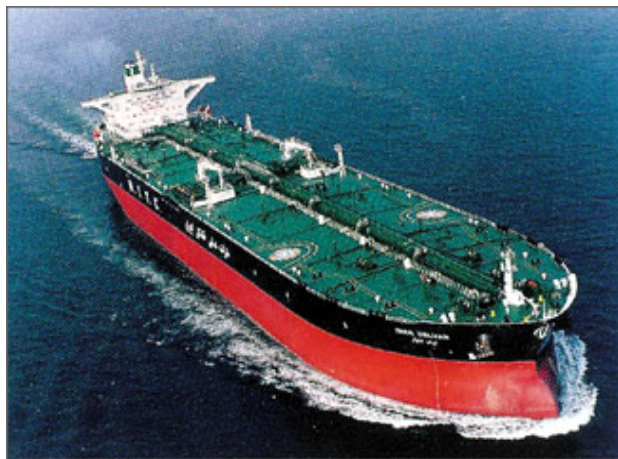
China-built oil tanker for Iran

“Iran’s growth of power in the region and the international arena is to Beijing’s interest,” he stated.