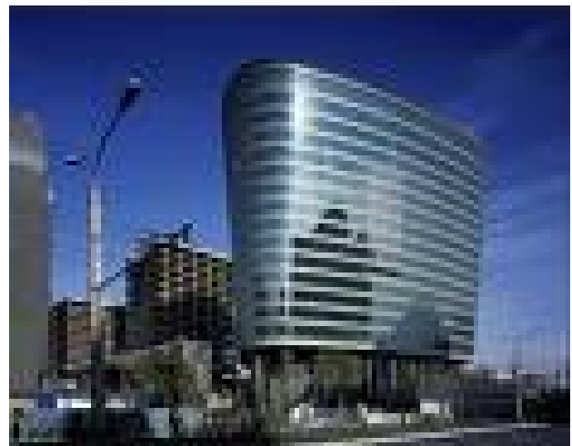
CNOOC in Beijing

While BP, Royal Dutch Shell, Total, and GDF are holding back, China and others are pushing forward. The China National Offshore Oil Corporation (CNOOC) reportedly concluded a deal for a $16 billion investment in Iran's North Pars natural gas field in December—in the midst of negotiations on the third round of UN sanctions.