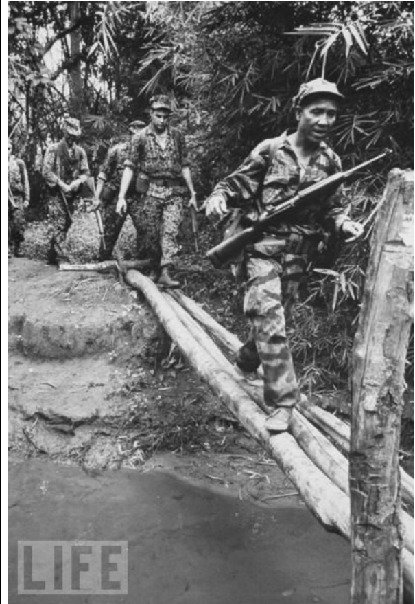
US Special Forces and Montagnard troops in Vietnam

The second Vietnam War revealed a peculiarly American penchant for relying on military solutions. At one level was counter-guerrilla warfare to “win the hearts and minds” of the Vietnamese people. Under Kennedy, this effort was shaped by the conviction that communist organizers in the countryside of the Third World were no more than “scavengers of the modernization process.” “Communism is best understood as a disease of the transition to modernization,” said Walt Rostow in a much-publicized speech. 29 If guerrilla warfare, Soviet leader Nikita Khrushchev’s “military arm,” could be defeated in Vietnam, Rostow proclaimed, there would be no more Cubas, Congos, or Vietnams. Kennedy clearly agreed. 30