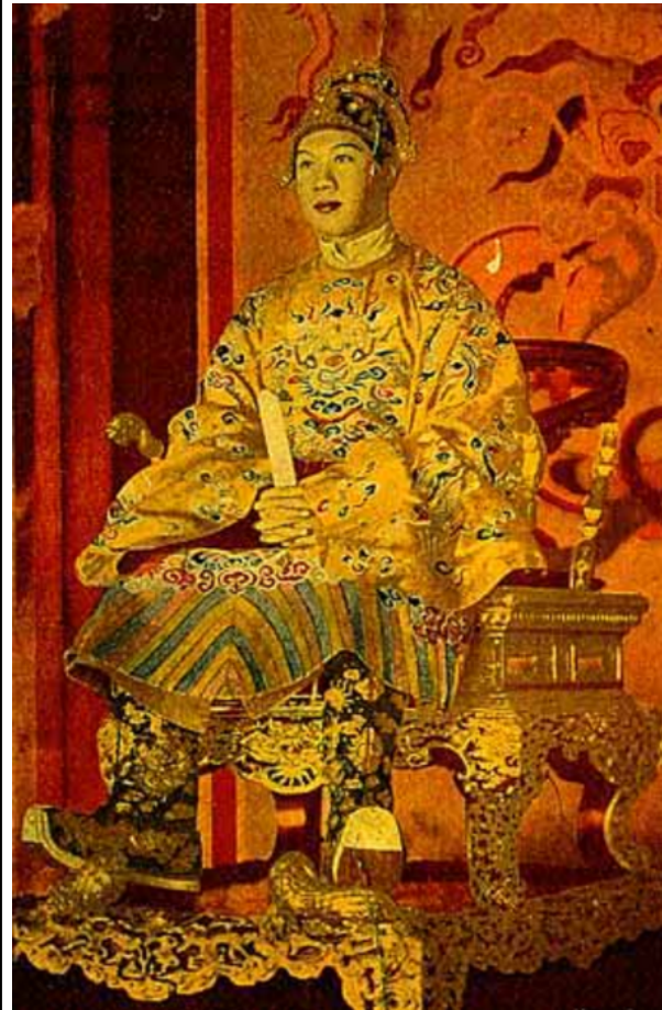
Emperor Bao Dai

These and other official assessments prophesied that the loss of even a single country to communism would be the beginning of a political and economic disaster for U.S. interests. Consequently, whereas before Korea, the security community’s advice to the president was to support the “Bao Dai solution” and sustain the French war effort, after Korea—and as the French effort began to fail—the United States was looking for ways to contain a presumptively Chinese threat and prevent a negotiated capitulation to Ho Chi Minh’s forces. Thus, NSC 5405 rejected any political solution, including a coalition government in Vietnam, and instead stated: “It will be U.S. policy to accept nothing short of a military victory in Indo-China.” 27