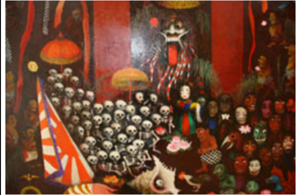
"The Night of the Festival of Garugan" (1988), an oil by Tomiyama Taeko (trimmed).

Consequently, most of my exhibitions have been held in European countries, the United States and South Korea, because in those places there were no problems at all in showing my social-issue paintings and prints.