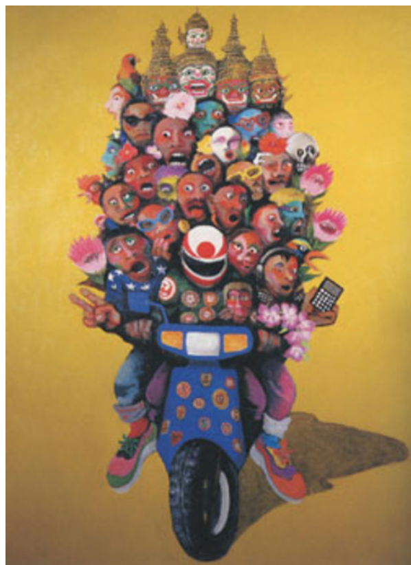
"Let's go to Japan" (1991), an oil by Taeko Tomiyama (trimmed). COURTESY OF THE ARTIST

Funnily enough, though, those kinds of people don't bother much about works of literature, because it takes time to read them carefully. But they can see paintings in a moment, so they can more easily target the fine arts.