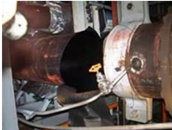
Pipes at aging Mihama reactor ruptured, releasing steam that killed four and injured seven in 2004

Second, having muddled the waters on energy policy, the Cabinet then shifted responsibility for any future reactor restarts to the new Nuclear Regulatory Authority and reactor hosting communities. The head of the NRA initially demurred, stating that his organization merely assesses operational safety and does not have responsibility for reactor restarts. He later recanted, but pointed out that utilities also share responsibility for reactor restarts because they have to get local communities to agree. But who, in what communities, gets to decide? Now that the NRA widened the designated evacuation zone around nuclear plants to 30 km, the towns near reactors also want more say in restarts since they bear the same risks, but don't receive the subsidies given to reactor hosting communities. Because lines of responsibility and authority are now dispersed and blurred, it is not clear where the buck stops, a strategy for undermining opposition.