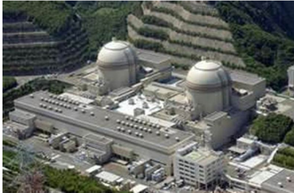
The Oi reactors may be sited on an active fault-line