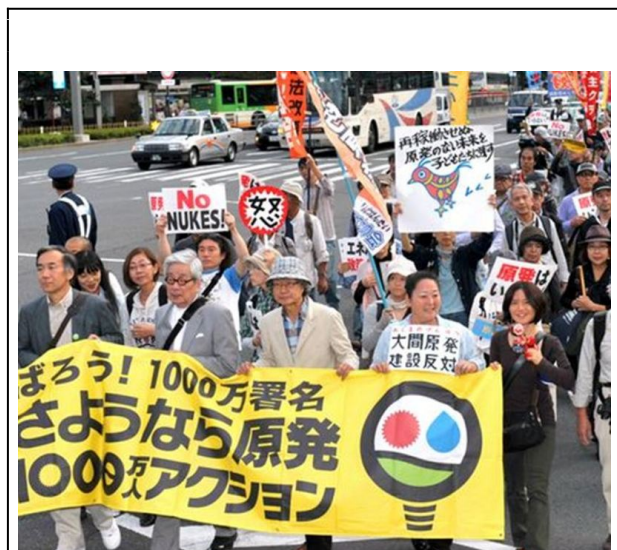
Nobel laureate Oe Kenzaburo (2 nd front left) leads anti-nuclear demonstration in Tokyo on October 13, 2012, the day after TEPCO's admission of guilt

investigations assert that the meltdowns were preventable and refuted Tokyo Electric Power Company's (TEPCO) claim that the massive tsunami was an inconceivable black swan event that caused the three meltdowns and hydrogen explosions. Finally, on October 12, 2012 TEPCO abandoned its tsunami defense and acknowledged that the nuclear accident was caused by its excessively optimistic risk assessments, shortchanging of safety and training, and failure to adopt appropriate countermeasures.