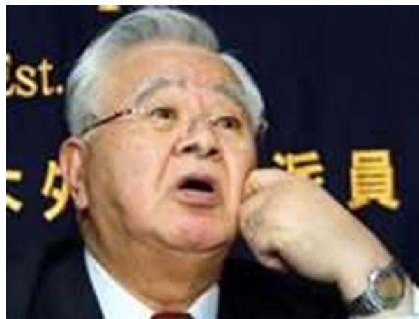
Keidanren Chairman Yonekura Hiromasa

and with "constant verification and revision" — hedges that might keep the nuclear industry in business indefinitely." (Financial Times 10/24/2012) The Cabinet caved on its pledge to phase out nuclear energy just one day after the nation's three largest business groups Keidanren (Japan Business Federation), Keizai Doyukai (Japan Association of Corporate Executives) and the Japan Chamber of Commerce and Industry issued a joint statement complaining that the government had ignored their objections to a nuclear phase-out. Keidanren Chairman Yonekura Hiromasa inveighed, "We object to the abolition of nuclear power from the standpoint of protecting jobs and people's livelihoods. It is highly regrettable that our argument was comprehensively dismissed." (Asahi 9/19/2012) Publically admonished by the nuclear village elders, the Cabinet promptly flip-flopped.