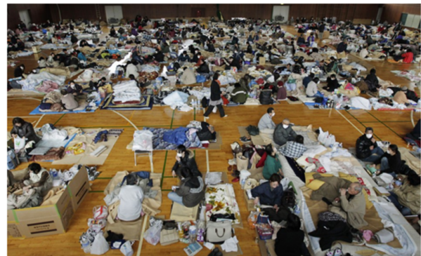
Fukushima evacuation center

confidence motion showed that a vast majority of Japanese did not think ousting Kan was a pressing priority even though he was unpopular. In the court of public opinion, the verdict on national politicians is dereliction of duty.