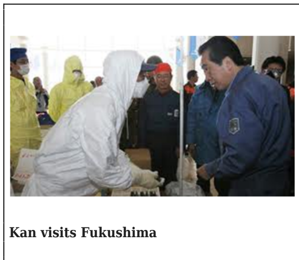
Kan visits Fukushima

Kan was a convenient lightning rod for this frustration, and because he stepped on powerful toes in the “nuclear village”, there was an orchestrated campaign to oust him. For example, twice TEPCO spread false information that was aimed at tarnishing Kan, only to recant. TEPCO claimed that Kan's visit to the stricken reactors on March 12 was the reason why venting did not proceed, thus causing the hydrogen explosions on March 12th, 13th and 15th.