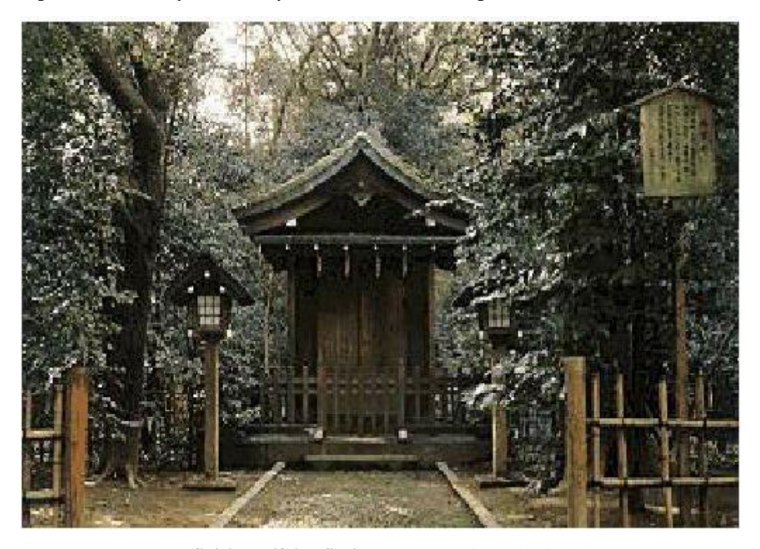
The Spirit Pacifying Shrine

Visitors to the Great spring and autumn rites are not encouraged to visit the Chinreisha or Spirit pacifying shrine. In fact, the vast majority of them are entirely ignorant of its presence. This is because the Chinreisha sits to the southern side of the Main sanctuary enclosed by a steel fence. The shrine was built in 1965 and the steel fence was erected a decade later. The reason for the construction of the fence, as explained to this author, was that the chief priest at Yasukuni had received intelligence that unknown persons were planning to blow the Chinreisha up. It is clear, however, that the very existence of the Chinreisha is a matter of great controversy within the Yasukuni priesthood. Why would anyone want to blow it up; what makes it controversial?