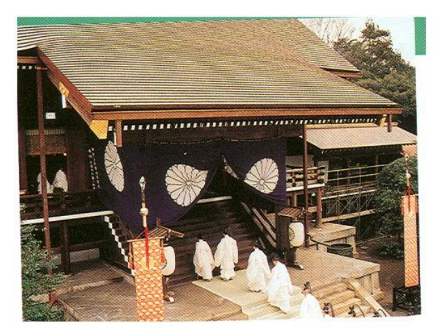
The Main Sanctuary

The most important of several ritual spaces is that within the Honden or Main sanctuary. This is the central, elevated building located along the east-west axis that runs up from the bottom of Kudan hill. It is within the deepest darkest recesses of the Honden that the kami reside; there that priests make them offerings every morning and evening every day of the year. The other buildings along the main axis are the Haiden or Worship hall and the Reijibo hoanden or Shrine archive. The pilgrim to Yasukuni passes under the first torii at the bottom of Kudan hill, through the wooden gate and under the second and third torii to confront the Worship hall. It is here that pilgrims bow their heads, clap their hands before the Yasukuni kami. On more formal occasions, the pilgrim enters the Worship hall and observes the ritual activity in the Main sanctuary across the garden that separates the two buildings. The Honden was built in 1872 and the Haiden in 1901. The Repository, constructed of earthquake proof reinforced concrete directly above the Yasukuni air raid shelter, is more recent. It was built in 1972 with a private donation from the Showa emperor, Hirohito.