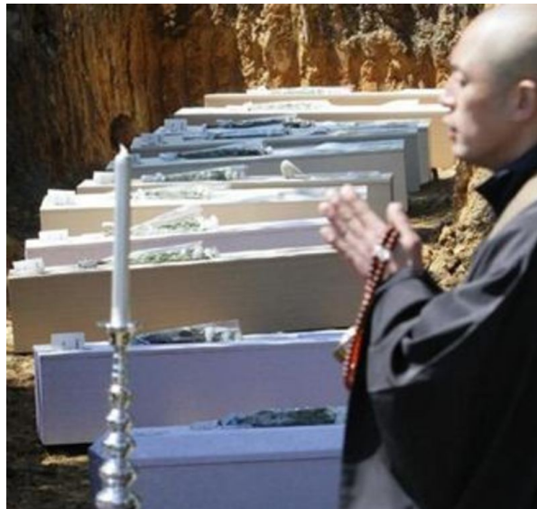
Buddhist priests and coffins of tsunami victims

Just how closely Buddhism is connected to suffering can readily be seen in Buddhism's basic teachings as encapsulated in the Four