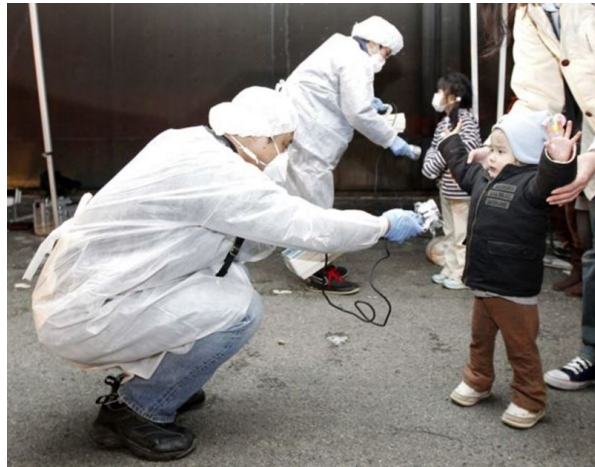
Child undergoing a radiation check

The April 3, 2011 edition of Newsweek described the current situation in Japan as follows: