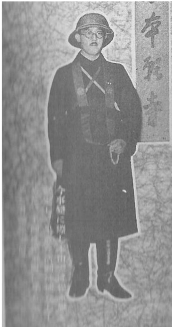
Buddhist military chaplain

Unlike US military chaplains, Buddhist chaplains did not wear military uniforms, but their military boots and pith helmets made it clear that they, too, were part of Japan's military effort. Many commanders found it comforting to have their unit's Buddhist chaplain accompany them on periodic tours of the front lines based on the belief that the priest's allegedly miraculous powers would insure their safety.