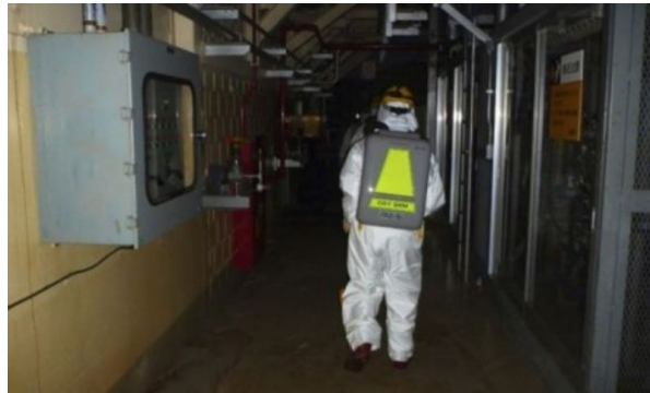
Worker in the early days of the Fukushima accident

In the years since the advent of the Heisei period (1989), Japan has experienced numerous crises, ranging from political, financial, and social turmoil to natural disasters, as if inheriting the turbulence of the previous eventful and painful Showa history (1926-89). In the face of calamity, however, the Japanese people have always impressed the world with their extreme resilience and what is often referred to as their "stoicism." It has been generally suggested that the Japanese people are impressively responsive to disasters, given their all too frequent experience of calamity in an island country located on the Pacific "rim of fire."