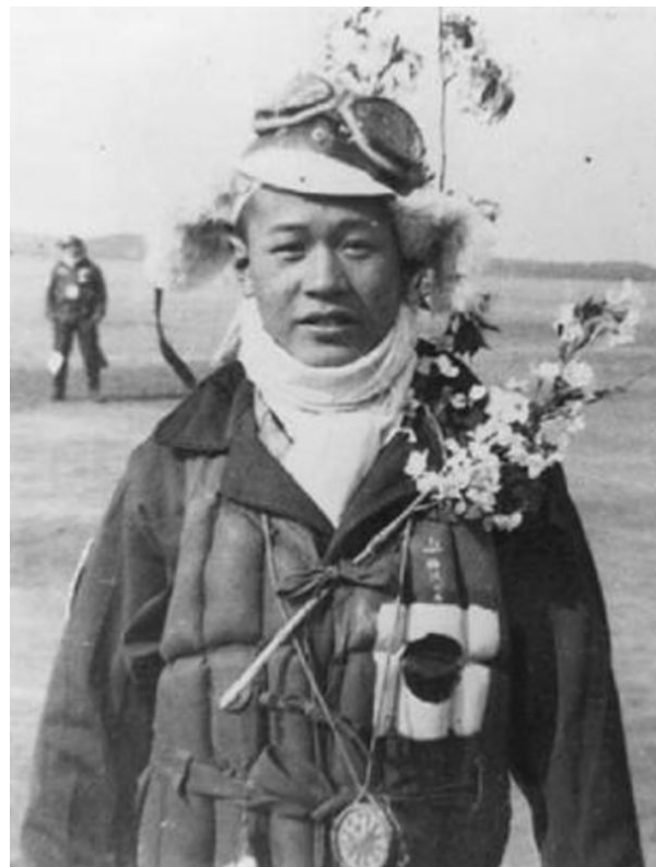
Kamikaze pilot covered in cherry blossoms

"practical work" on the battlefield lay a metaphysics that promoted a value that became increasingly important the longer the war lasted - resignation to one's death. Buddhism was seen as providing the quickest route to acquiring the needed resignation, for it was Buddhism that taught living means to suffer since neither human nature nor the world we live in are perfect. During our lifetime, we inevitably endure physical suffering such as pain, sickness, injury, old age, weakness, and eventually death; and we have to endure such psychological suffering as sadness, fear, frustration, disappointment, and depression. Thus, life in its totality is imperfect and incomplete because our world is subject to impermanence. Since we are never able to keep permanently what we strive for, we must accept that we ourselves as well as all we hold dear will inevitably pass away.