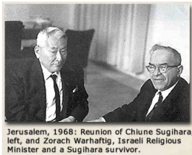
Jerusalem, 1968: Reunion of Chiune Sugihara, left, and Zorach Warhaftig, Israeli Religious Minister and a Sugihara survivor.

The Japanese life story of Sugihara Chiune would contain yet another unexpected development. In 1968, Sugihara's past caught up with him. One of the Jewish refugees he had saved by issuing the transit visas—an Israeli civil servant—located him. In 1969, the Israeli Minister of Religion—another refugee saved by Sugihara's visas—invited him to Israel and awarded him the Israeli Ministry of Religion Prize for his actions during the war.