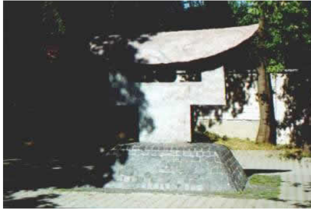
Sugihara Memorial in Vilnius, Lithuania